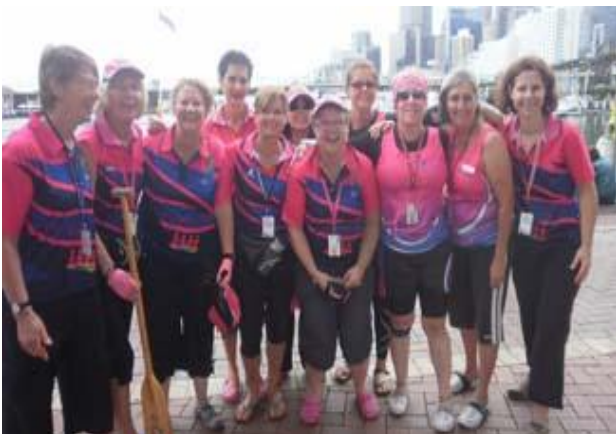
Meeting other DA teams, Chinese New Year, Darling Harbour, 13 February 2011