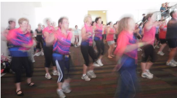
DA ACT shaking into Zumba fans after collecting donations worth $25,000, 23 January, 2011