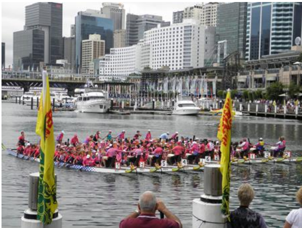
Dragons Abreast Australia, Flowers on the water ceremony , Chinese New Year, Darling Harbour, 13 February 2011 Check website for more images: https://picasaweb.google.com/DragonsAbreastAustralia/CNY2011#

PO Box 7191, Yarralumla ACT 2600 • DRAGONSABREAST.COM.AU • ISSUE 39 • FEBRUARY 2011