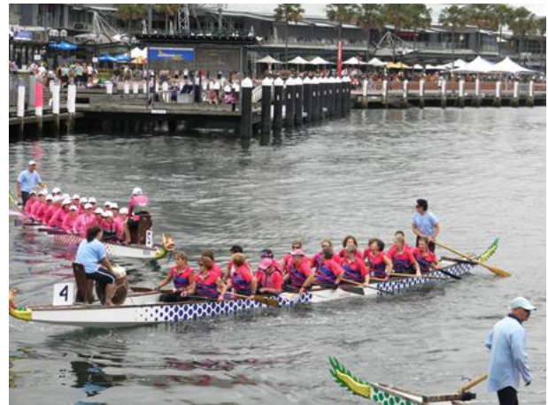
Dragons Abreast ACT, Chinese New Year, Darling Harbour, 13 February 2011