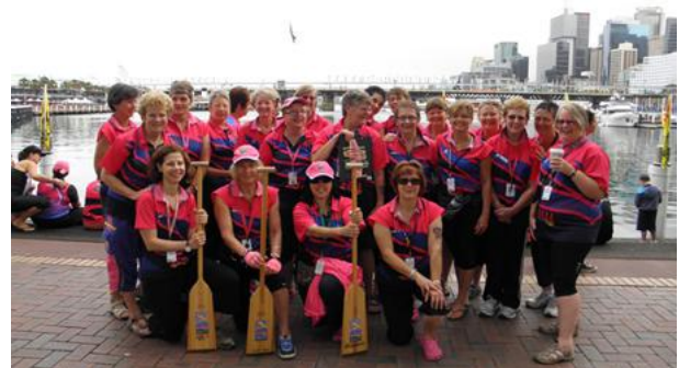
Dragons Abreast ACT team, Chinese New Year, Darling Harbour, 13 February 2011