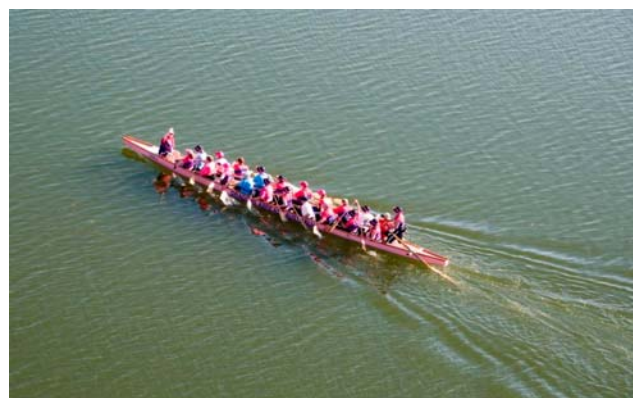
DA ACT, Lake Burley Griffin