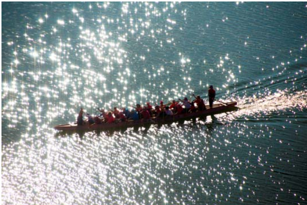
DA ACT, Lake Burley Griffin