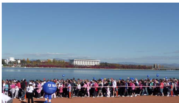
Mother's Day Classic, 10 May 2009

Kerrie.griffin@act.gov.au or taylorclan@inet.net.au