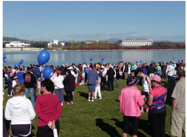
Mother's Day Classic, 10 May 2009

A few members walked the course or volunteered at the Mother's Day Classic .