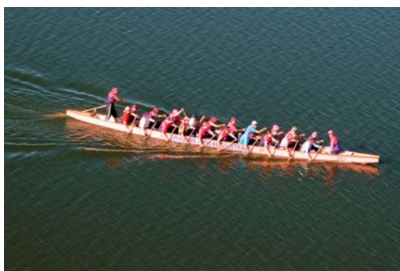
DA ACT, Lake Burley Griffin