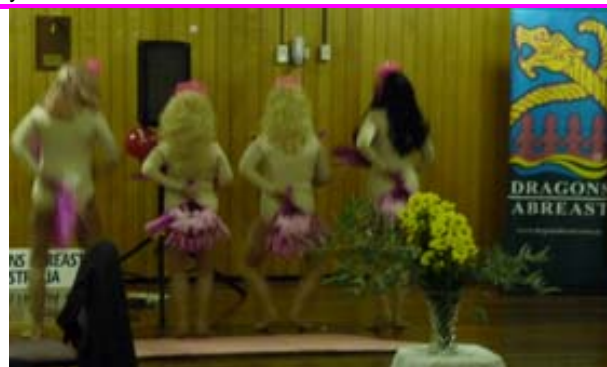
The Goanna Fans finale at the Dragon Muster, 19 June 2009