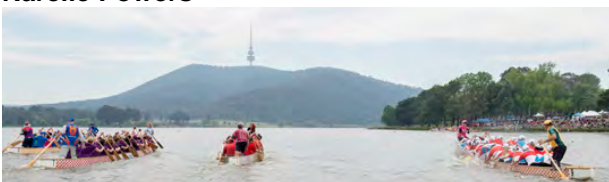
12 th Dragons Abreast Canberra Centennial Corporate Challenge, 20 October 2013, Weston Park