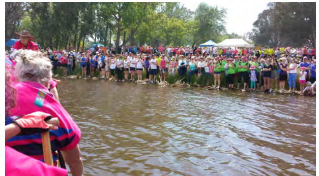
12 th Dragons Abreast Canberra Centennial Corporate Challenge, 20 October 2013, Weston Park