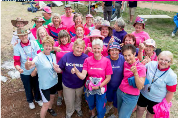
Volunteers, 12 th Dragons Abreast Canberra Centennial Corporate Challenge, 20 October 2013, Weston Park

PO Box 7191, Yarralumla ACT 2600 • DRAGONSABREAST.COM.AU • ISSUE 52 • NOVEMBER 2013