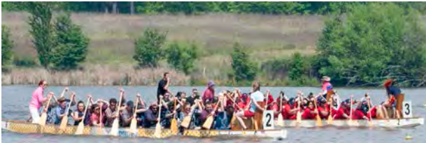
12 th Dragons Abreast Canberra Centennial Corporate Challenge, 20 October 2013, Weston Park

The Canberra dragon boat community worked well together , all clubs provided sweeps and training for the corporate teams during the lead up to the big day, with much of the training done in the afternoons. Sometimes the weather was so wild that we were contained in Lotus Bay where it was nothing to see 6-8 dragon boats going round and round and many wet people. However, this didn't deter them from showing up again and on the day.