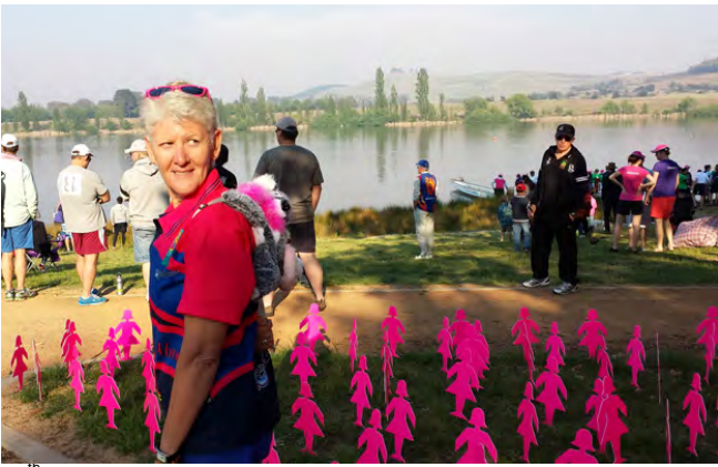
12 th Dragons Abreast Canberra Centennial Corporate Challenge, 20 October 2013, Weston Park