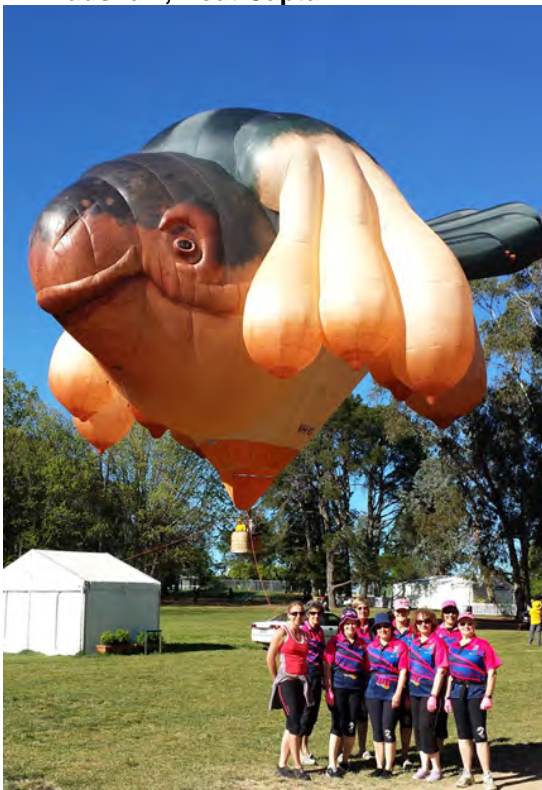
DA Canberra visited Floriade and saw the Skywhale up close, 12 October 2013