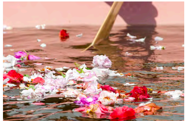
DAA Flowers on the water ceremony, 12 th Dragons Abreast Canberra Centennial Corporate Challenge, 20 October 2013, Weston Park

What a great day it turned out to be, perfect weather, fantastic volunteers all over Weston Park working as a team to create a fabulous atmosphere. DA Canberra members, family and friends, were hard working and efficient in all areas. We had many comments about what a great vibe and fantastic feedback.