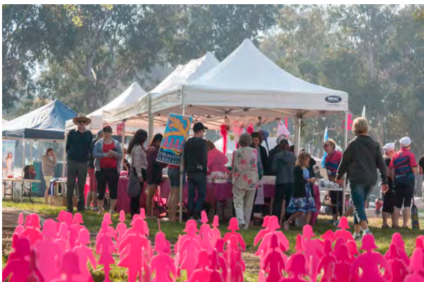
BCNA Mini Field of Women, 12 th Dragons Abreast Canberra Centennial Corporate Challenge, 20 October 2013, Weston Park