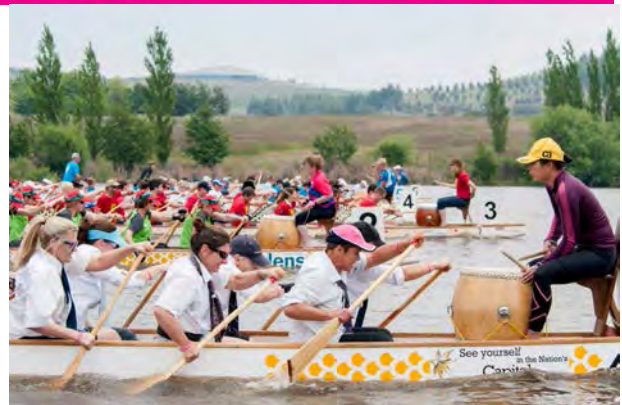
12 th Dragons Abreast Canberra Centennial Corporate Challenge, 20 October 2013, Weston Park Corporate and Community Regatta: official team photographs now available!