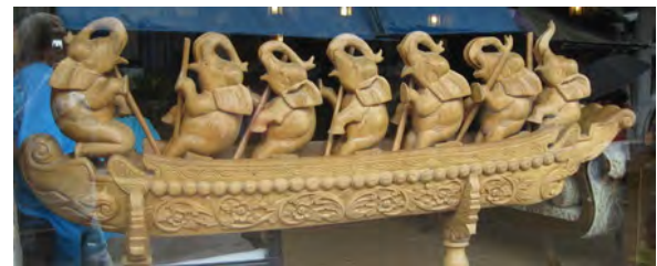
Thai elephants dragon boating sculpture

http://www.dragonsabreast.com.au/ http://www.dragonsabreast.com.au/act/