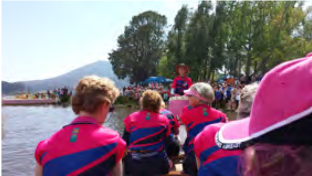
12 th Dragons Abreast Canberra Centennial Corporate Challenge, 20 October 2013, Weston Park