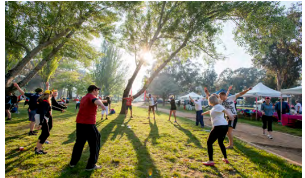
Warm up exercises, 12 th Dragons Abreast Canberra Centennial Corporate Challenge, 20 October 2013, Weston Park