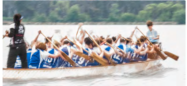
12 th Dragons Abreast Canberra Centennial Corporate Challenge, 20 October 2013, Weston Park