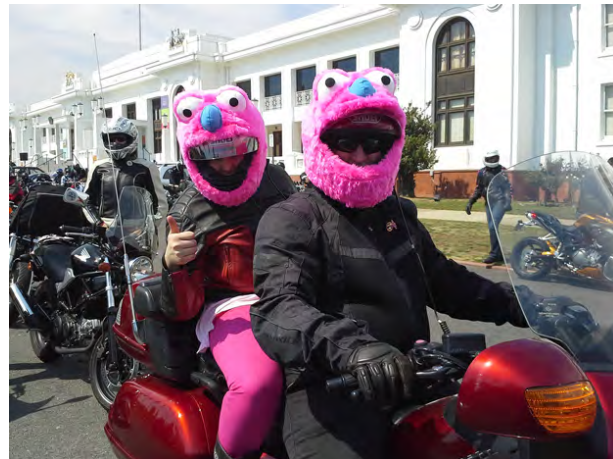
150 motorcyclists participated in the inaugural BCNA Pink Ribbon Ride, Old Parliament House, 20 October 2013