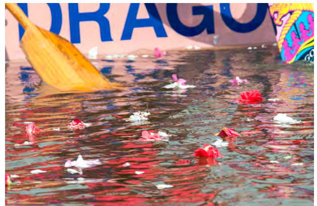
12 th Dragons Abreast Canberra Centennial Corporate Challenge, 20 October 2013, Weston Park