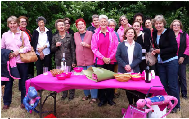
12 th Dragons Abreast Canberra Centennial Corporate Wind Up, 12 November 2013, Lotus Bay