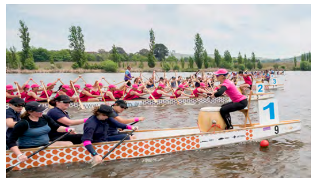
12 th Dragons Abreast Canberra Centennial Corporate Challenge, 20 October 2013, Weston Park