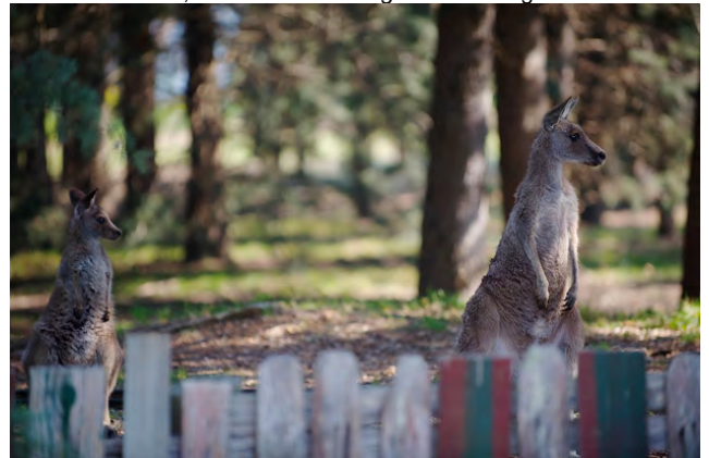
Kangaroos visit the 12 th Dragons Abreast Canberra Centennial Corporate Challenge, 20 October 2013, Weston Park

DRAGONS ABREAST – keeping the spirit alive!