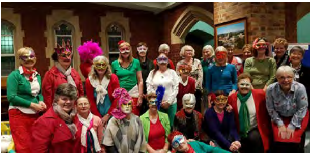
GoAnna's Gathering with Venetian masks 24 August 2018