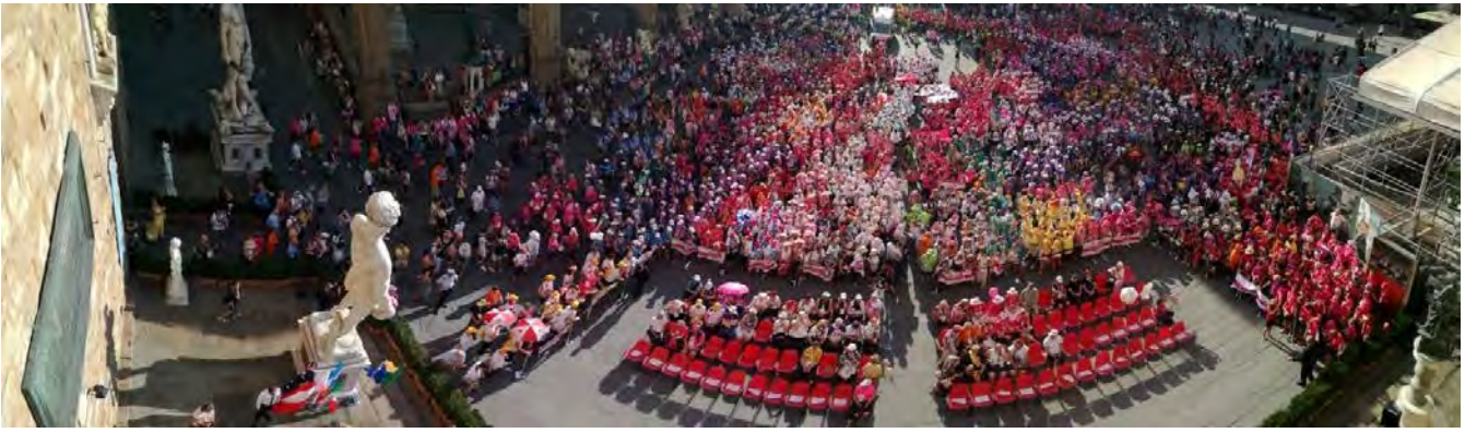
IBCPC Opening Ceremony parade to Piazza della Signoria for an. 6 July 2018