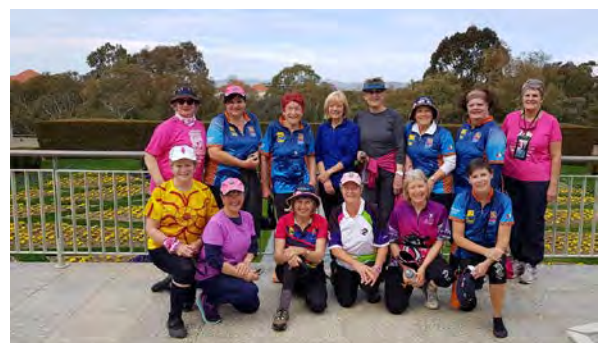
Parliament House gardens walk 12 September 2018