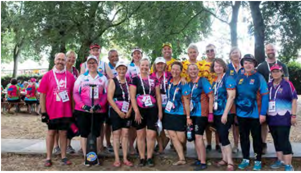
DA Canberra supporter crew 7 July 2018