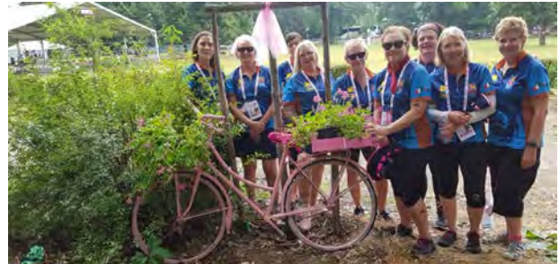
DA Canberra, Florence, Italy 7 July 2018

https://www.facebook.com/jenny.nicholls.921/videos/vb.1194133956/10216732303958672/?type=3