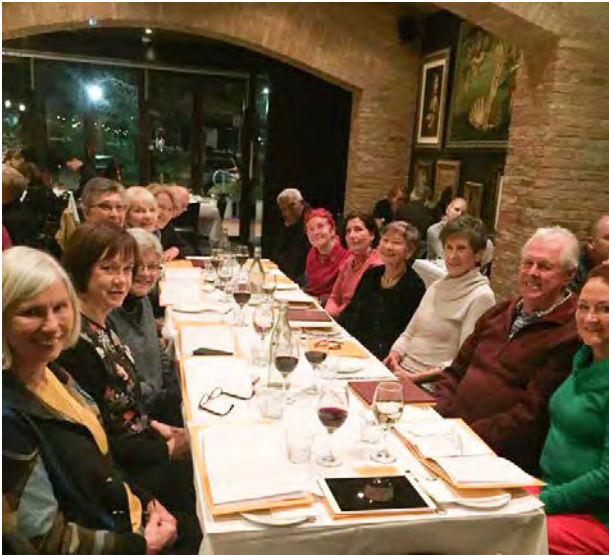
DA Canberra Italian dinner, La Cantina 6 July 2018