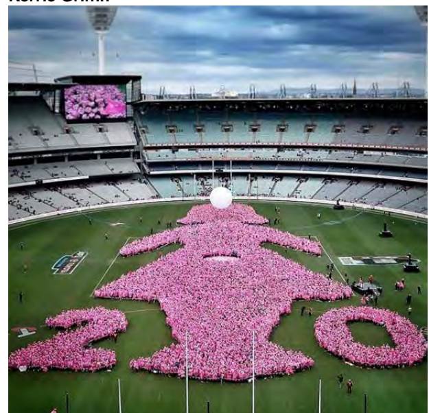
BCNA NEWS16 AUG 2018 See all the Field of Women photos here at the MCG 12 August 2018