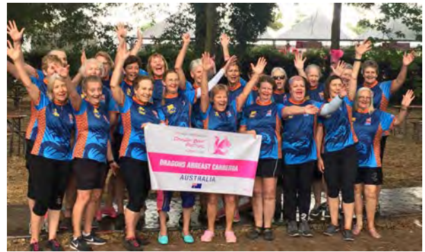
DA Canberra breast cancer survivor full crew 7 July 2018

Everything about Florence seems to be coloured with a mild violet, like diluted wine. Henry James, US writer