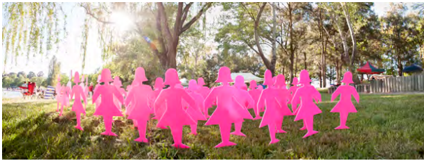
BCNA Mini Field of Women at the Dragons Abreast Canberra Corporate and Social Regatta 20 October 2012