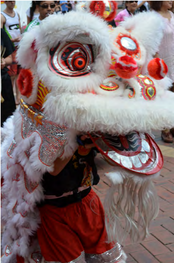
Chinese New Year Regatta, Darling Harbour Sydney, 24 February 2013