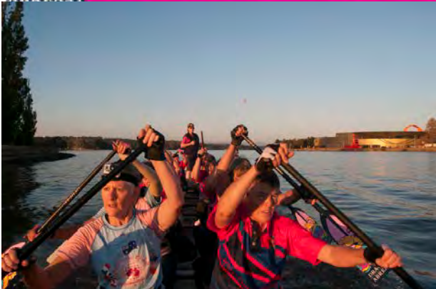
Dragons Abreast Canberra Dawn Paddle (62 photos)

PO Box 7191, Yarralumla ACT 2600 - DRAGONSABREAST.COM.AU • ISSUE 48 - MARCH 2013