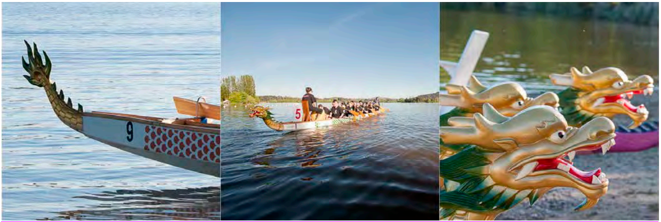
Dragons Abreast Canberra Corporate and Social Regatta 20 October 2012