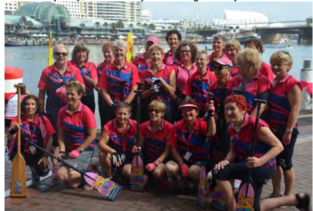
DA Canberra, Chinese New Year Regatta, Darling Harbour Sydney, 24 February 2013