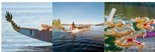
11 th Dragons Abreast Canberra Corporate and Social Dragon Boat Challenge 20 October 2012

All teams can download regatta images courtesy of Chris Holly Check Facebook for more: http://on.fb.me/VhVm0u http://www.facebook.com/dragonsabreast