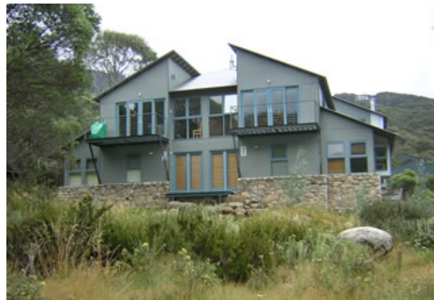
Creekside, Thredbo, Otis Foundation