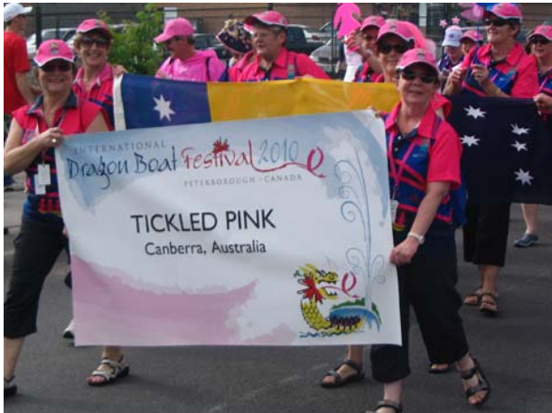
Street parade, Dragons Abreast ACT Tickled Pink team, Peterborough, Canada, 11 June 2010