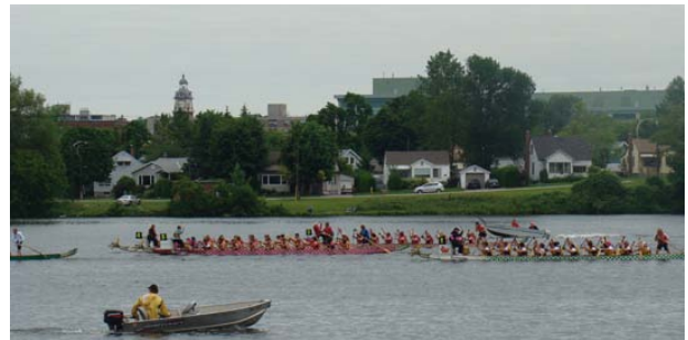
Dragons Abreast ACT Tickled Pink team, Peterborough, Canada, 12 June 2010

Congratulations to you all! It's so lovely getting your news. We're all thinking of you so much and sending so many good wishes and love. Have a hoot! Paddles up and go, go, go...!