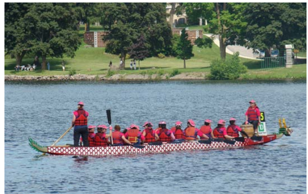
Dragons Abreast ACT Tickled Pink team, Peterborough, Canada, 13 June 2010