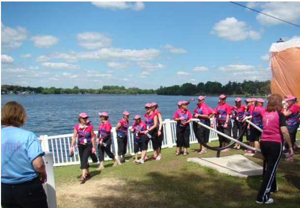
Dragons Abreast ACT Tickled Pink team, Peterborough, Canada, 13 June 2010