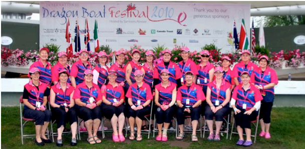
Dragons Abreast ACT Tickled Pink team, Peterborough, Canada, 12 June 2010