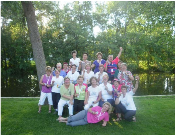
Dragons Abreast ACT Tickled Pink team's after party, Peterborough, Canada, 13 June 2010