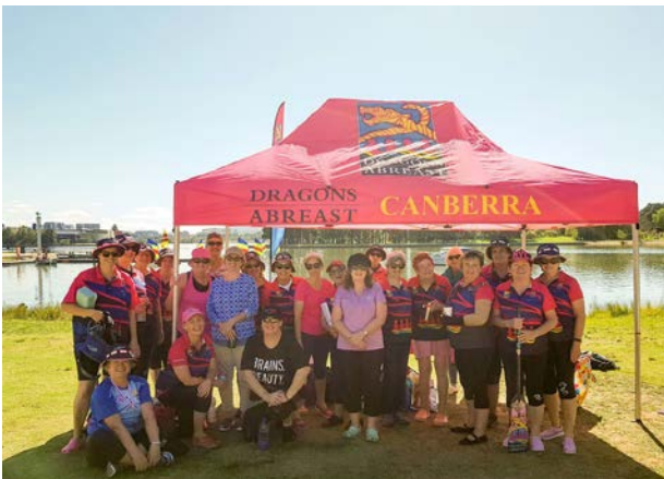
Come and try session 10 March 2018