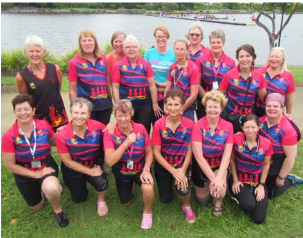
DA Canberra, AusChamps, Lake Kawana, Queensland 6 March 2018