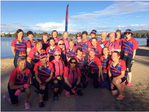
DA Canberra DB ACT regatta 3 February 2018