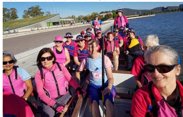
Canberra Balloon Spectacular, 10 March 2018