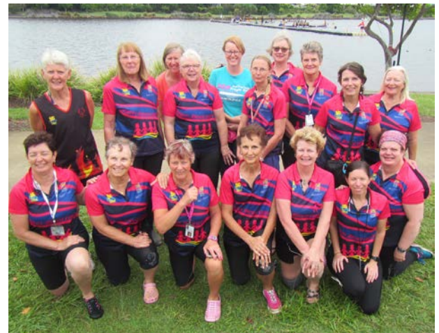
AusChamps, Lake Kawana, Queensland 6 March 2018