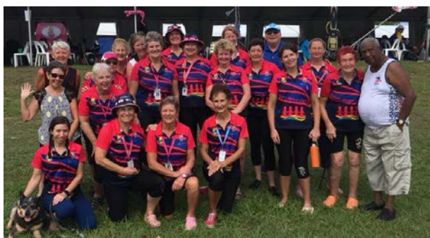
DA Canberra and supporters, AusChamps, Lake Kawana, Queensland 6 March 2018