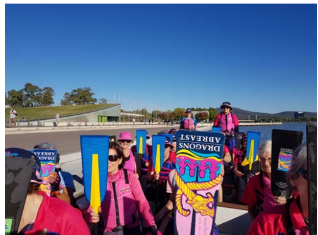
Stretches, Canberra Balloon Spectacular, 10 March 2018