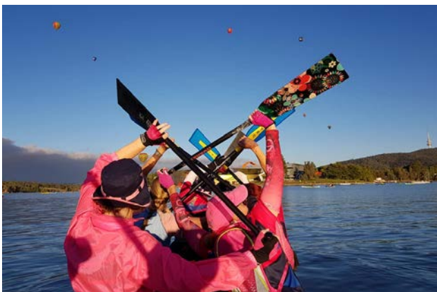
Stretching exercises, Canberra Balloon Spectacular, 10 March 2018