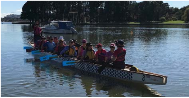
Come and Try Session, Lotus Bay 10 March 2018