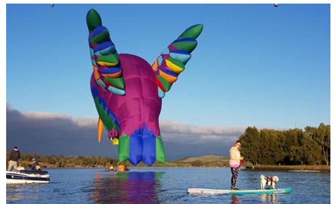
SUP with dog, Canberra Balloon Spectacular, 10 March 2018