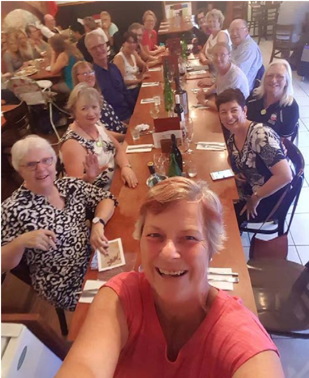
DA Canberra dinner, AusChamps, Lake Kawana, Queensland 6 March 2018