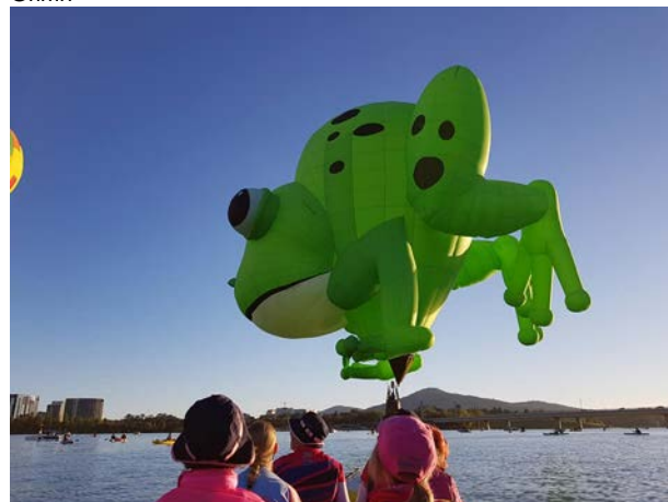
Canberra Balloon Spectacular, 10 March 2018