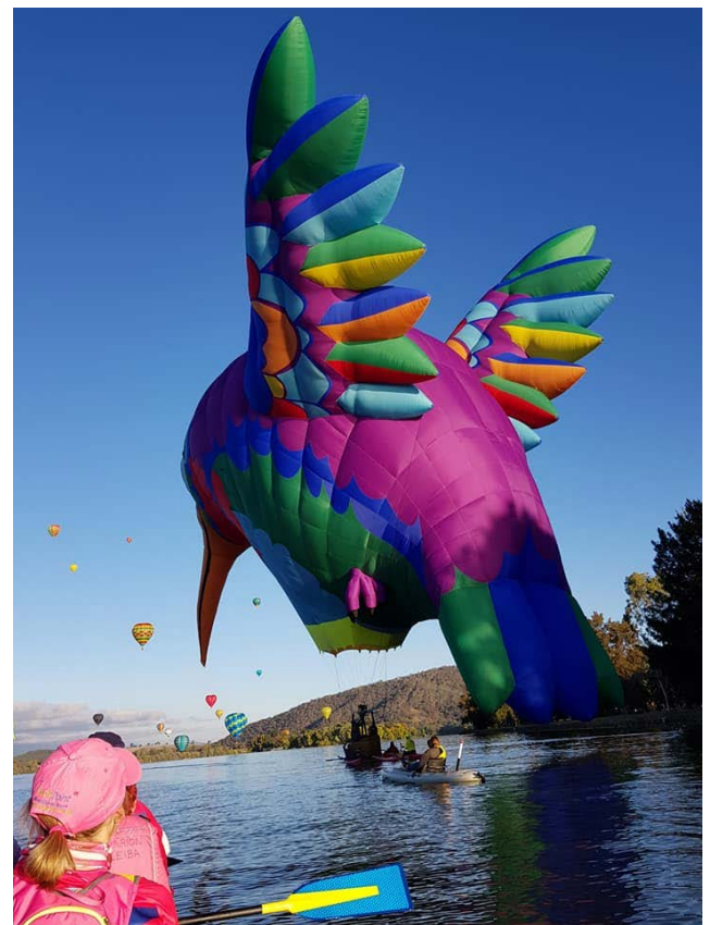
DA Canberra, Canberra Balloon Spectacular, 10 March 2018