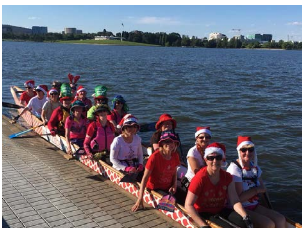
Christmas carol paddle 13 December 2017