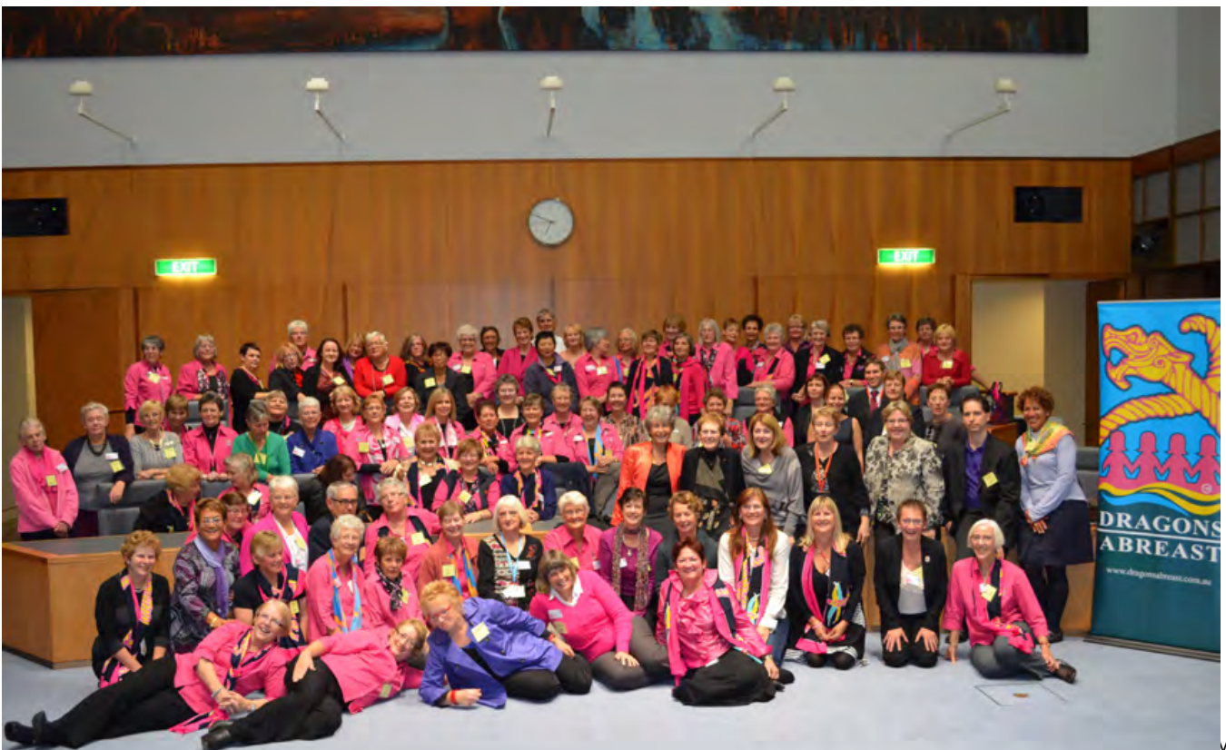
DAA Convention delegates, welcome reception, Parliament House, 17 May 2013