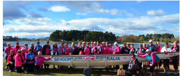
Lotus Bay, DAA Convention, 17 May 2013