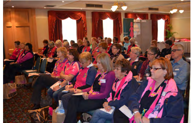
DA Pdragons, Penrith, DAA Convention, 18 May 2013