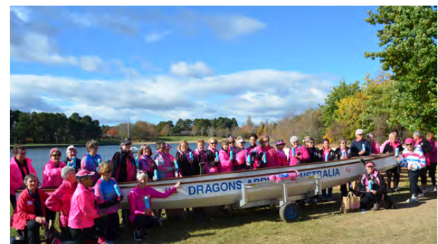
Lotus Bay, DAA Convention, 17 May 2013