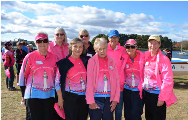
DA Illawarra, Lotus Bay, DAA Convention, 17 May 2013