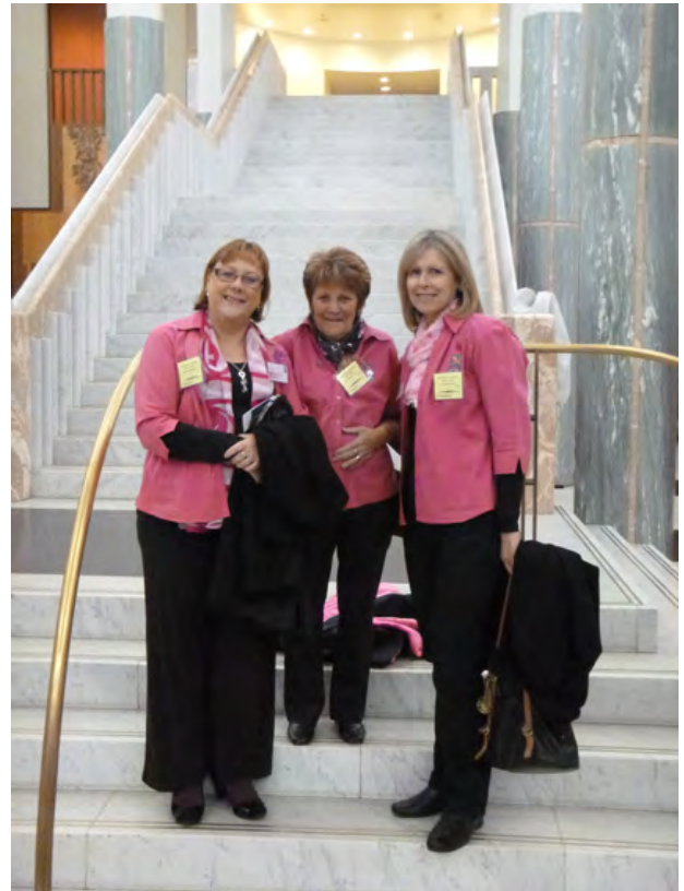
DAA Convention welcome reception, the foyer, Parliament House, 17 May 2013

personal journeys, healthy minds and bodies to developing a code of conduct, with a morning walk, meditation session and a magical sightseeing trip around the city's icons before meeting at the Australian War Memorial for the Convention dinner.