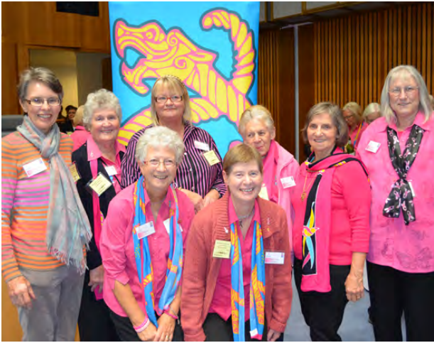
DA Illawarra and others, DAA Convention welcome reception, Parliament House, 17 May 2013