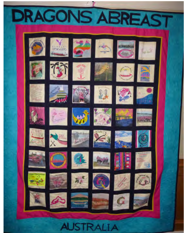
Unity quilt launch, DAA Convention, 18 May 2013

Some squares are beautifully embroidered or quilted by experienced sewers while others are more naively constructed by less experienced seamstresses. But, each is equally effective, representing established DAA groups as well as newer, struggling or starting out groups. Some squares, I regret to say, were touched by the iron or the scissors as the quilt team stretched and pulled them into shape and some have melted in the process of uniting the seams. Perhaps this