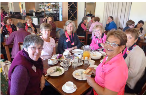
DA Gold Coast, Queensland, The Brassey of Canberra, DAA Convention, 18 May 2013