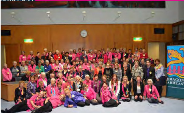
DAA Convention delegates, welcome reception, Parliament House, 17 May 2013

PO Box 7191, Yarralumla ACT 2600 • DRAGONSABREAST.COM.AU • ISSUE 50 • JUNE 2013