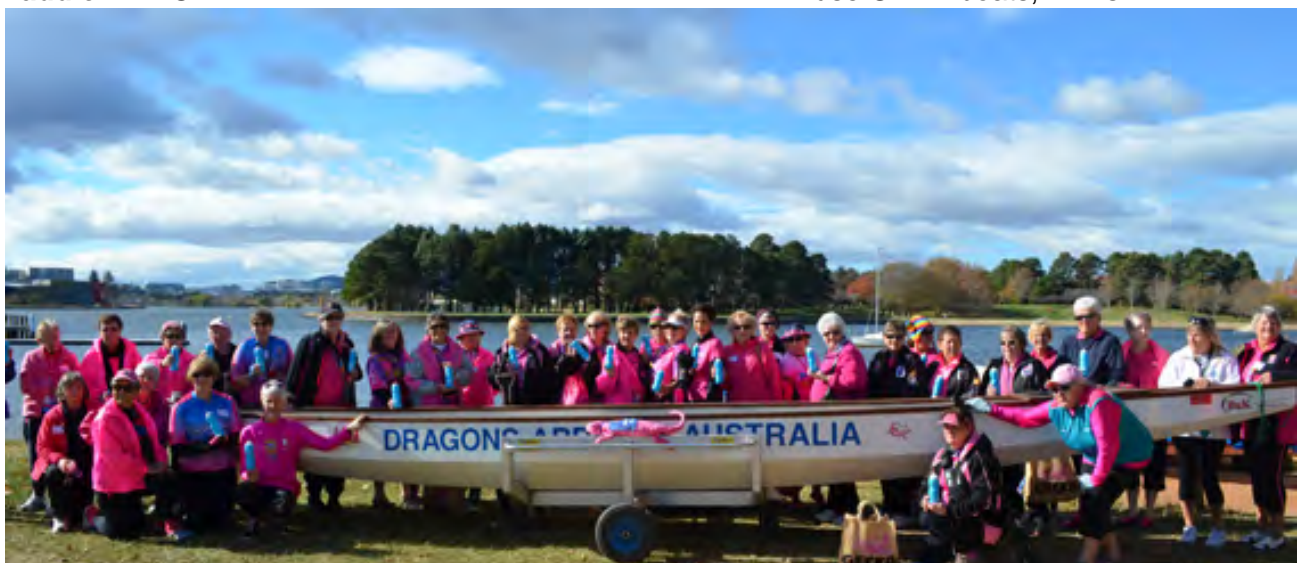
Lotus Bay, DAA Convention delegates, 17 May 2013

DRAGONS ABREAST – keeping the spirit alive!