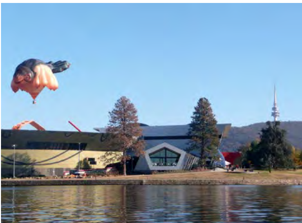
Skywhale over the National Museum of Australia, 11 May 2013