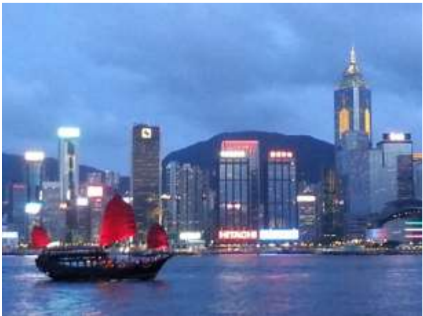
Victoria Harbour, Hong Kong 3 July 2015