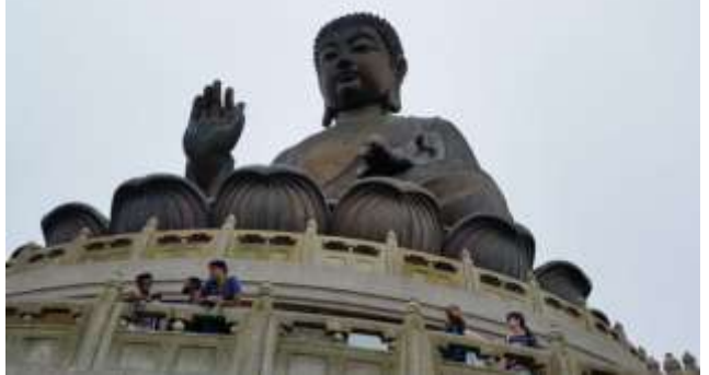
Tian Tan Big Buddha, Lantau Island, Hong Kong 2 July 2015