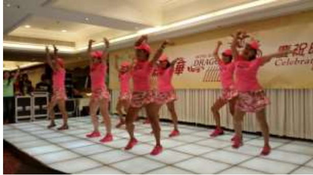
BCS paddlers in Pink from Singapore put on an awesome dance routine, Hong Kong banquet 5 July 2015