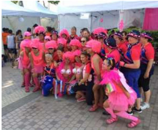
BCS Singapore won the dress up competition and Dragons Abreast, Hong Kong 5 July 2015