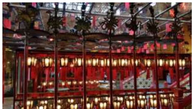
Man Mo Temple, built in 1847, Hong Kong 6 July 2015