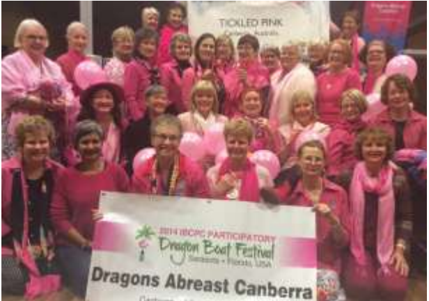
Dragons Abreast Canberra, IBCPC 20th anniversary, Dragon Muster 16 June 2015