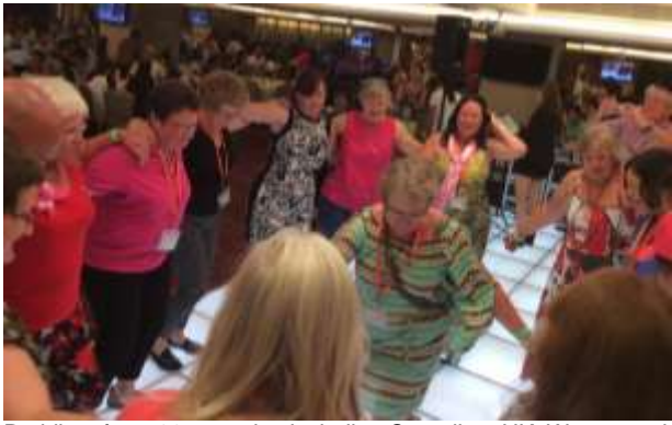
Paddlers from 11 countries including Canadian, UK, Wagga and Canberra dancing at the Hong Kong regatta banquet 5 July 2015