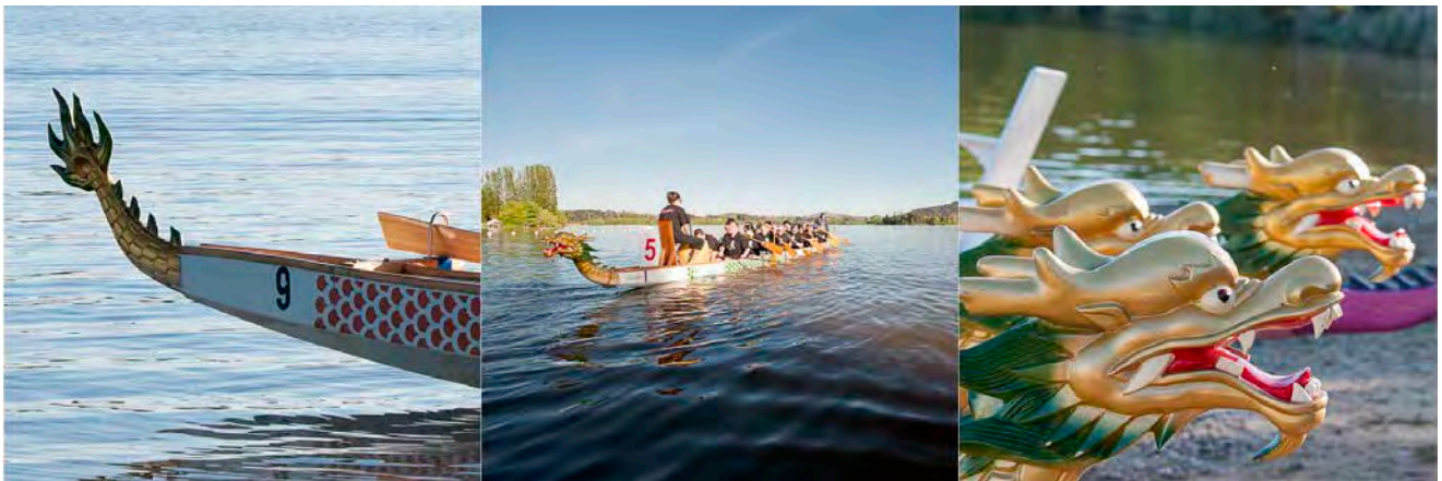
Dragons Abreast Canberra Corporate and Social Regatta 20 October 2012