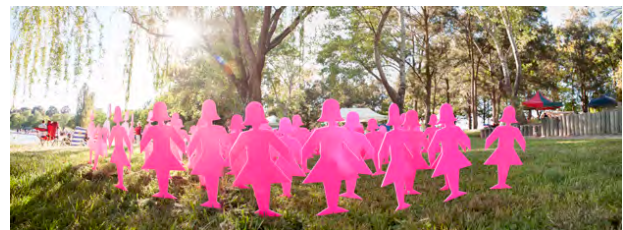
BCNA Mini Field of Women at the Dragons Abreast Canberra Corporate and Social Regatta 20 October 2012