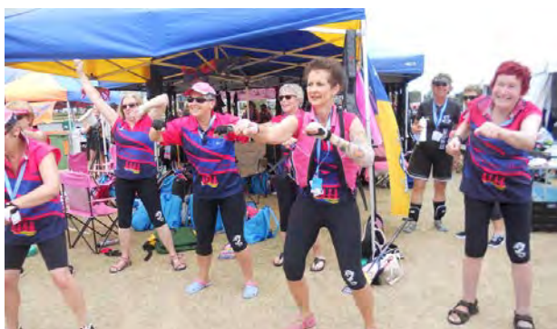
Warming up exercises, Pan Pacs Masters Games, Gold Coast, 9 November 2012