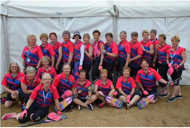
Dragons Abreast Canberra team, Pan Pacs Masters Games, Gold Coast, 10 November 2012