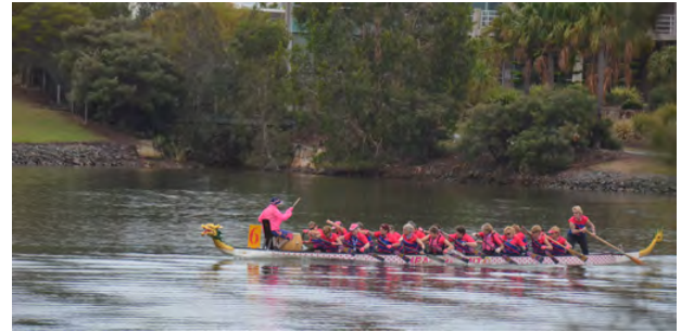
Fast and furious, Pan Pacs Masters Games, Gold Coast, 10 November 2012

DRAGONS ABREAST – keeping the spirit alive!