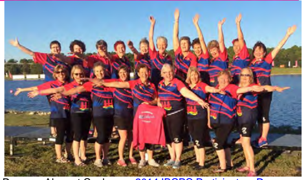
Dragons Abreast Canberra, 2014 IBCPC Participatory Dragon Boat Festival, Sarasota October 2014