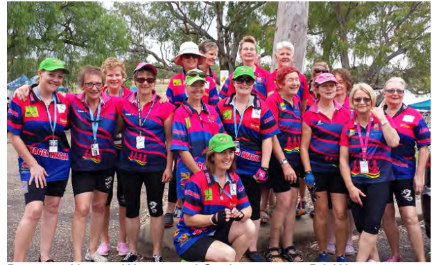
Dragons Abreast Wagga and Canberra team, DA Wagga regatta 30 November 2014