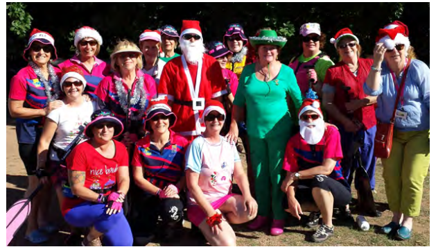
Dragons Abreast carols 17 December 2014