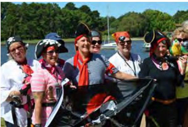
Dragons Abreast Canberra, DBACT flag pirate novelty race regatta, 17 January 2015 See article: