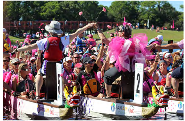
Flowers on the water ceremony, 2014 IBCPC Participatory Dragon Boat Festival, Sarasota October 2014