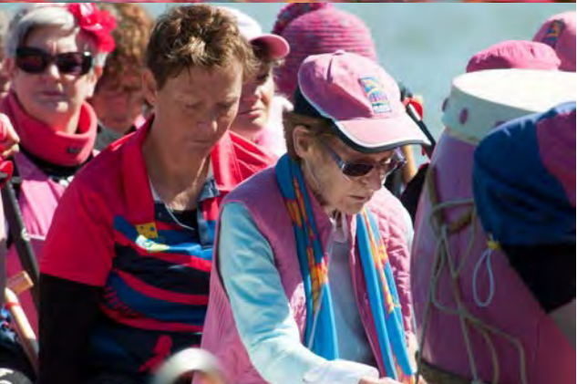
DRAGONS ABREAST – keeping the spirit alive!