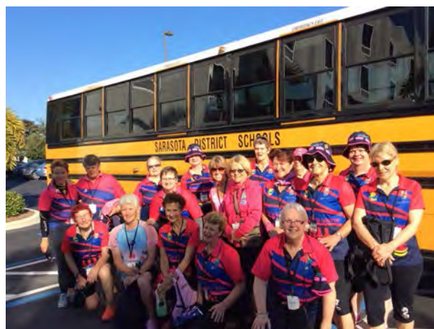
Dragons Abreast Canberra, 2014 IBCPC Participatory Dragon Boat Festival, Sarasota October 2014

It was overwhelming to finally arrive in Sarasota, Florida for the International Breast Cancer Paddlers' Commission International Participatory Dragon Boat Festival 2014 (IBCPC 2014). We were welcomed at the Tampa airport with banners and in Sarasota received good wishes, balloons, and pink goodies. The meeting with our respective crews and other international crews at our accommodation venues was also an emotional experience.