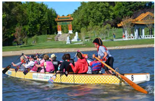
Dragons Abreast Canberra, 17 January 2015