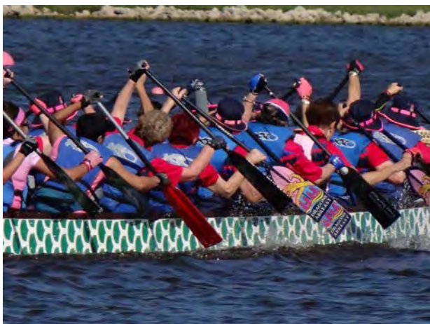
Dragons Abreast Canberra, 2014 IBCPC Participatory Dragon Boat Festival, Sarasota October 2014