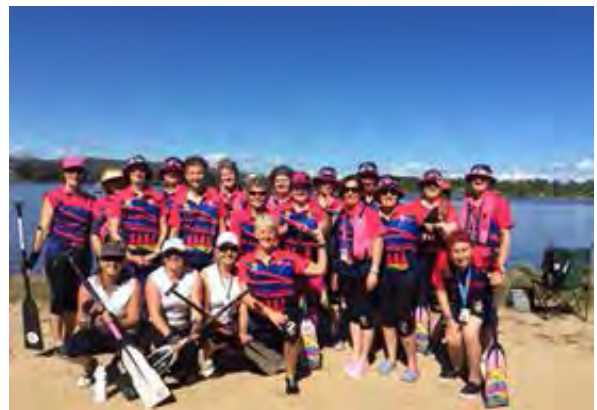
Dragons Abreast Canberra and Snow Dragons (white) at DBACT regatta 31 January 2015