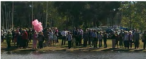
Anna's beautiful Flowers on the Water Ceremony 6 October 2014