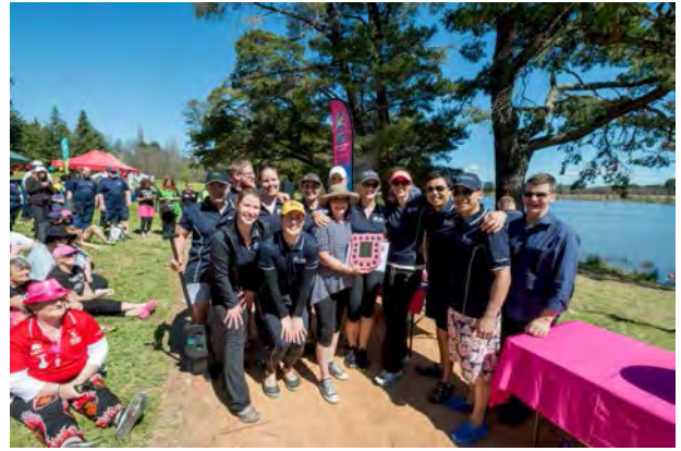
Dragons Abreast Canberra Corporate and Community Regatta, 20 September