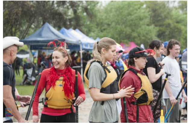
DA Canberra Social and Corporate Regatta 22 October 2022

Back to the racing, ten crews continued to battle it out, both on water and on land with racing over 200 metres, relays and obstacle courses. For sure, there were prize-winners but as far as Dragons Abreast Canberra are concerned, everyone — including the generous sponsors, DB ACT volunteers and other individuals — was a winner.