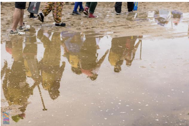
Rain reflections DA Canberra Social and Corporate Regatta 22 October 2022