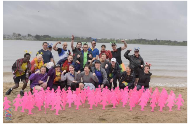
The Anna Wellings-Booth Memorial Trophy was presented to Reduced Stroke Risk Dept of Health who also came second and won the It's about us (best team bio) DA Canberra Social and Corporate Regatta 22 October 2022

Lake Burley Griffin turns pink (and red and orange and green and blue ...) for the 2022 DA Canberra Social and Corporate Regatta