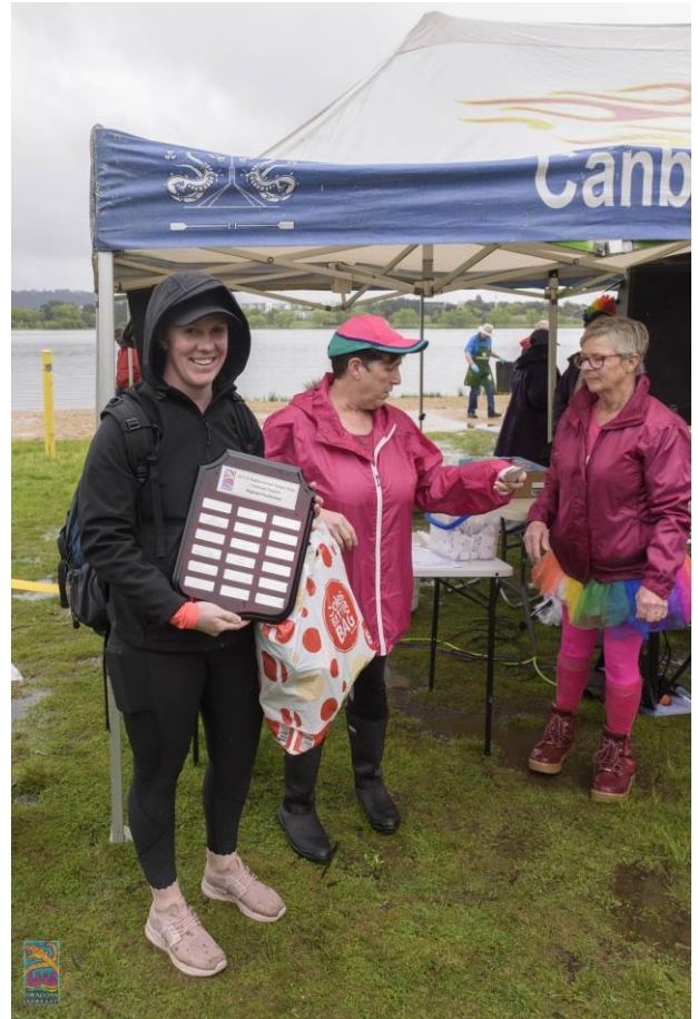
The Highest Fundraiser Shield was presented to Dept of Finance DA Canberra Social and Corporate Regatta 22 October 2022