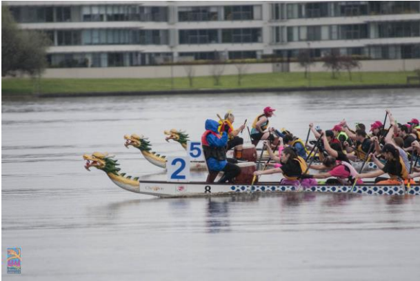
DA Canberra Social and Corporate Regatta 22 October 2022