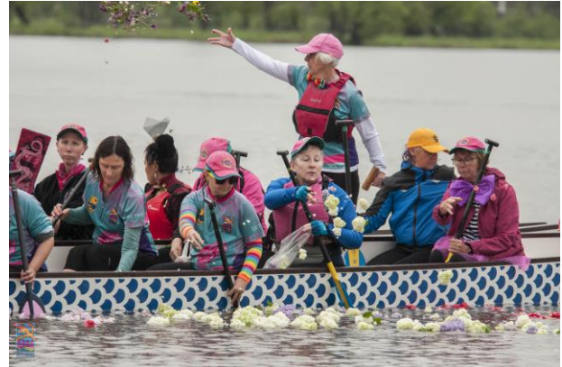
Flowers on the water ceremony, DA Canberra Social and Corporate Regatta 22 October 2022 Flowers on the Water @ DAC Social & Corporate Regatta