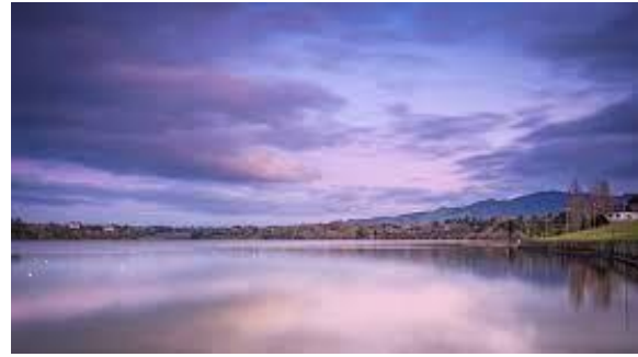
Lake Karapiro, New Zealand Home | 2023 IBCPC Dragon Boat Festival

Background information on the Dragon Spirit Award