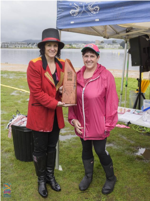
GeoDragons was awarded the Pink Lady Shield and the Sylvia Flaxman Dragon Spirit Award, for the team most in keeping with the ethos of Dragons Abreast, and Home Sweet Home (best decorated campsite), DA Canberra Social and Corporate Regatta 22 October 2022 Trophy Presentations @ DAC Social & Corporate Regatta 2022