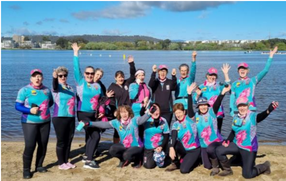
DA Canberra, DB ACT Regatta 1 15 October 2022