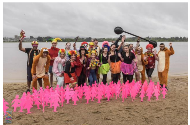
GeoDragons DA Canberra Social and Corporate Regatta 22 October 2022