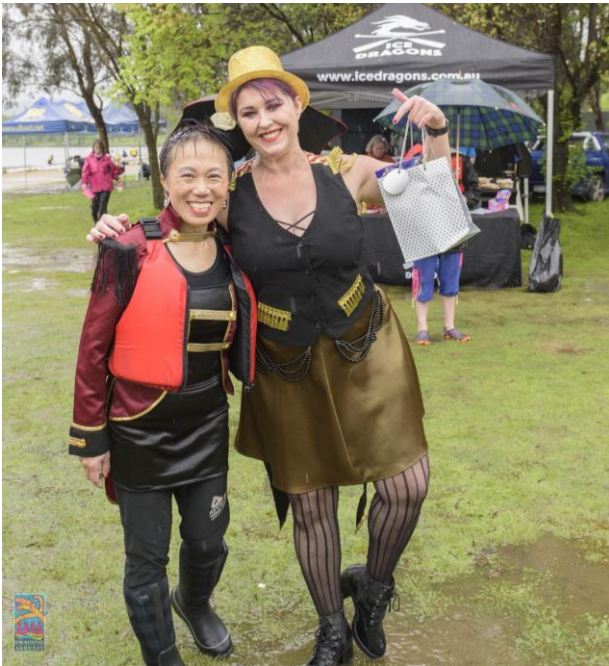
Noise makers (best war cry) Cirque de'Nous, DA Canberra Social and Corporate Regatta 22 October 2022