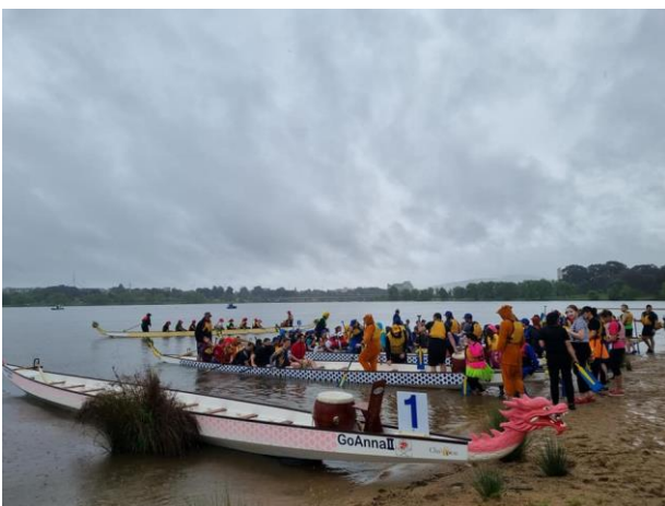
DA Canberra Social and Corporate Regatta 22 October 2022