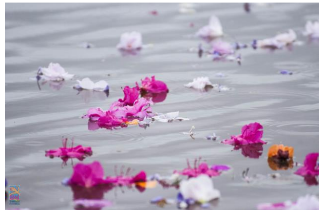
Flowers on the water ceremony, DA Canberra Social and Corporate Regatta 22 October 2022