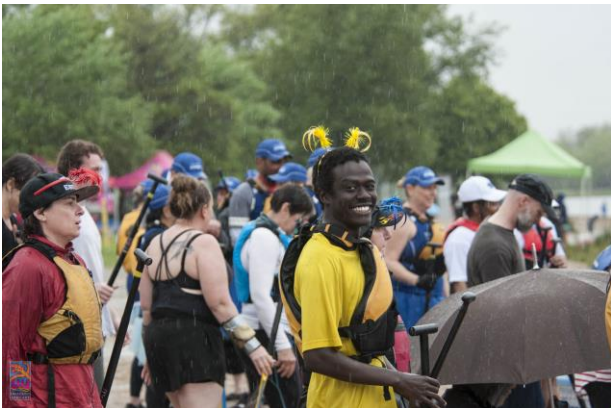
DA Canberra Social and Corporate Regatta 22 October 2022

https://www.facebook.com/DragonsAbreastCanberra/photos/?ref=page_internal&tab=album