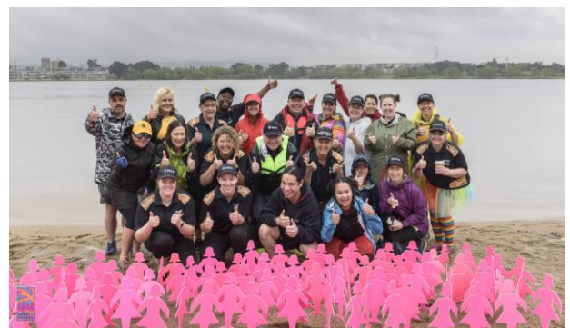
NIAA, DA Canberra Social and Corporate Regatta 22 October 2022