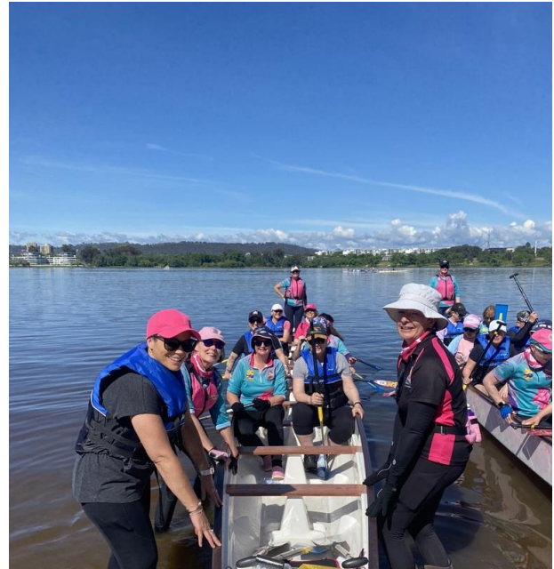
DA Come and try 12 November 2022