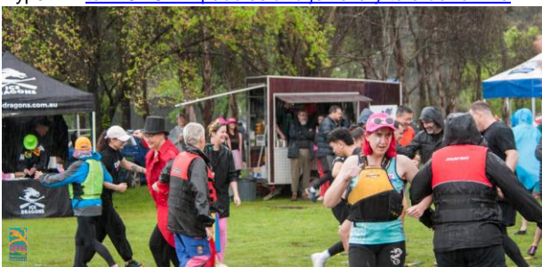
Warm ups DA Canberra Social and Corporate Regatta 22 October 2022

Hyperlink to IBCPC NZ paddles and jewellery to order online