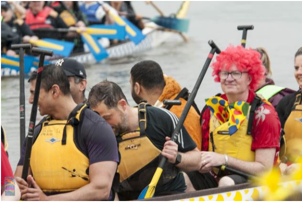
GeoDragons DA Canberra Social and Corporate Regatta 22 October 2022