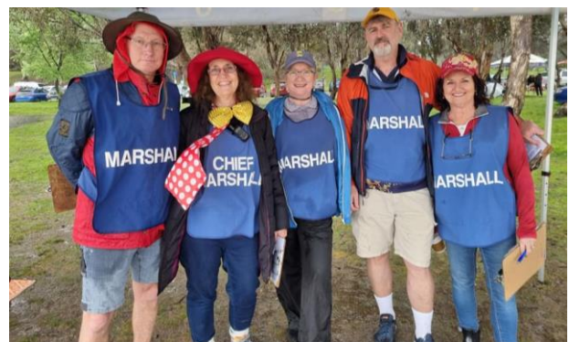
Marshall volunteers, DA Canberra Social and Corporate Regatta 22 October 2022