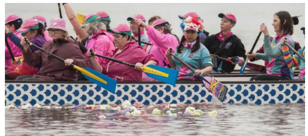
Flowers on the water ceremony DA Canberra Social and Corporate Regatta 22 October 2022