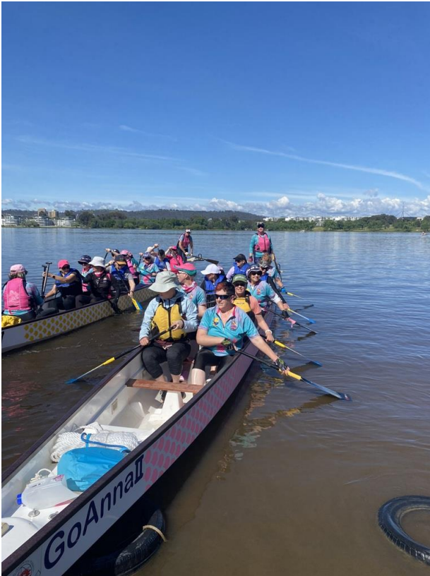
DA Come and try 12 November 2022