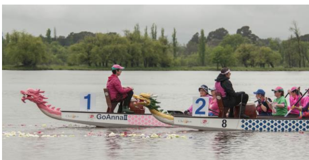
Flowers on the water ceremony, DA Canberra Social and Corporate Regatta 22 October 2022