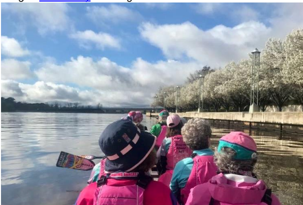
Spring blossoms, Lake Burley Griffin 10 September 2022