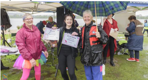
DOMA won third place, plus Let's Get Physical (Best team warm-up), Go Team (most organised) DOMA Hotel, DA Canberra Social and Corporate Regatta 22 October 2022 Other Presentations @ DAC Social & Corporate Regatta