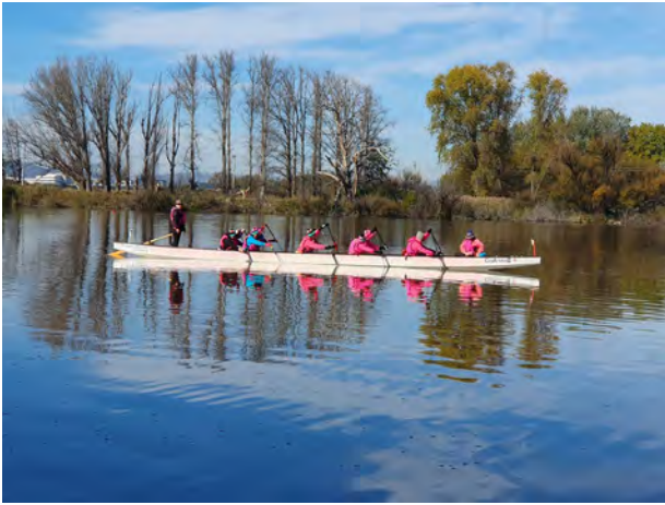
DA Canberra 6 May 2023