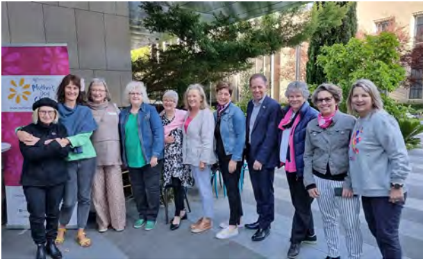
Mother's Day Classic MDC IWD launch 8 March 2023