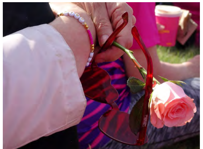
Flowers on the water ceremony, Lucy's hand, NZ 16 April 2023

Links to 2023 IBCPC Participatory Dragon Boat Festival, Lake Karapiro, New Zealand website images and drone videos: