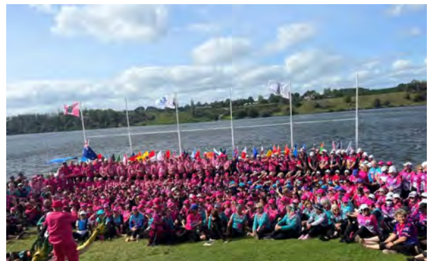
Most of the DAA contingents 2023 IBCPC Participatory Dragon Boat Festival, Lake Karapiro, New Zealand . 16 April 2023 DAA