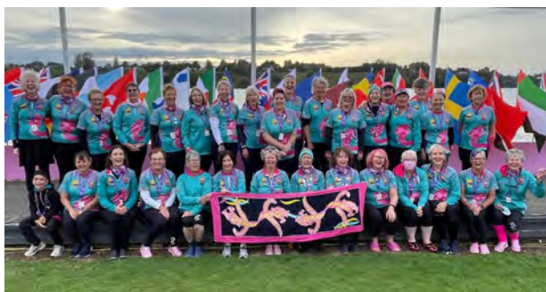
DA Canberra, Lake Karapiro, NZ 16 April 2023

Links to 2023 IBCPC Participatory Dragon Boat Festival, Lake Karapiro, New Zealand website images and drone videos: https://www.ibcpc.com/