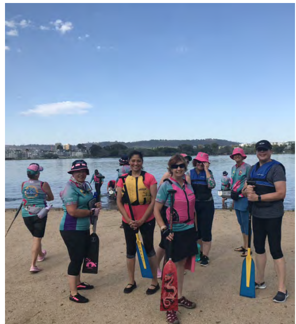
DA Come and try 18 February 2023

Two sessions are scheduled (4 June and 10 September) They are essential as not only is it an opportunity for paddlers to show their competency 'swimming' 100m (so as not to have to wear PFDs in the boat) but, more importantly, to understand exactly what to do to keep ourselves and each other safe in the event of a capsize. Huge thank you to Anita Godley for running them in a way that makes everyone feel safe and comfortable.