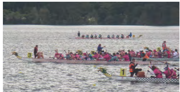
DA Canberra supporters won the supporter's race, Lake Karapiro, NZ 16 April 2023