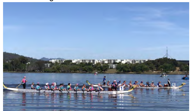
DA Canberra team, DB ACT Championships 19 March 2023