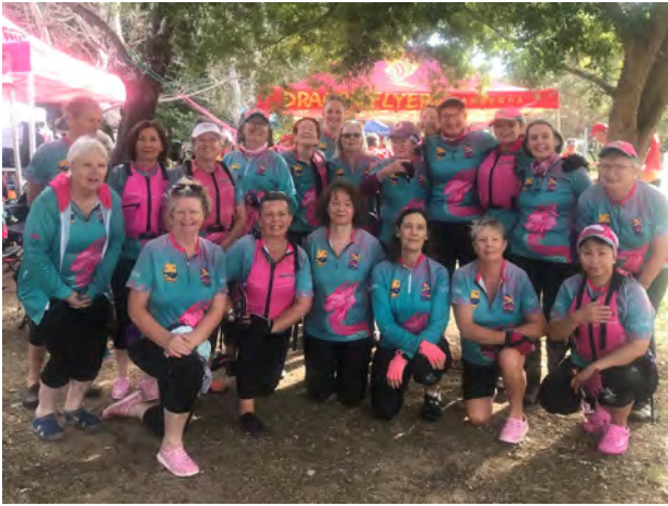
DA Canberra team, DB ACT regatta 6 4 March 2023