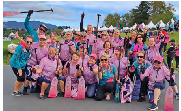
DA Canberra Wanderers and Pink Dragon Ladies Sweden, Lake Karapiro, NZ 16 April 2023