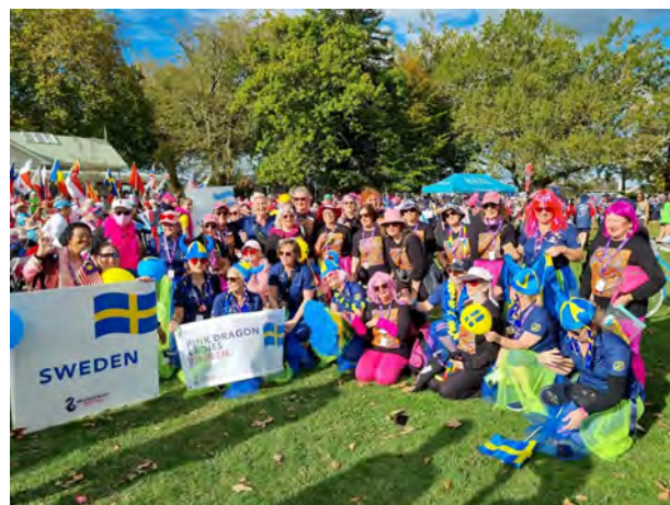
Pink Dragon Ladies Sweden and DA Canberra, Pink Parade, Cambridge, NZ 14 April 2023