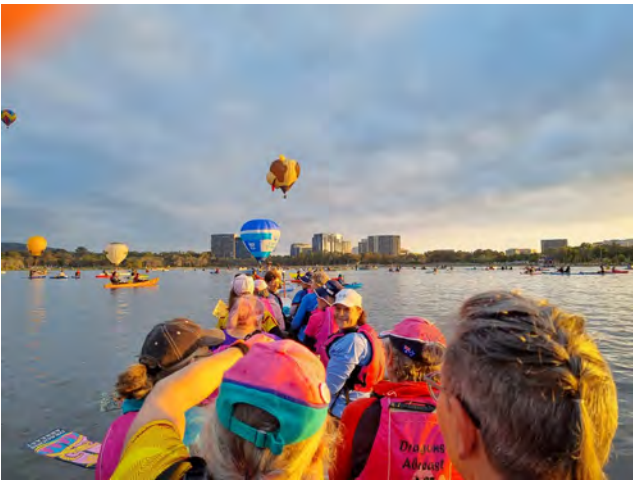
Canberra hot air balloon spectacular 12 March 2023