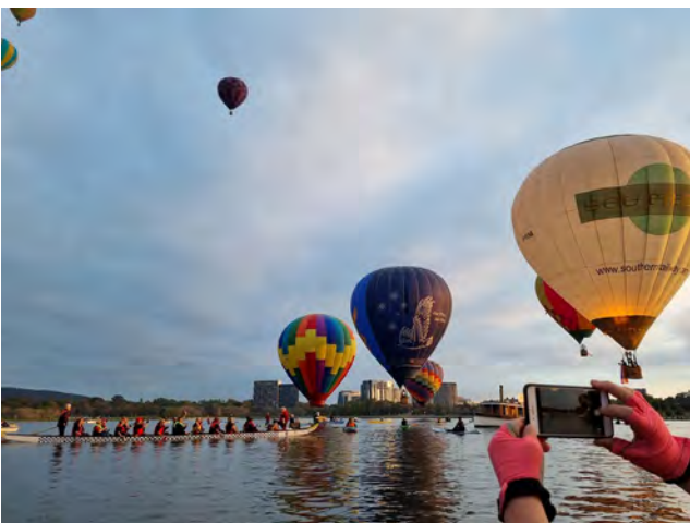
Diamond Phoenix, Canberra hot air balloon spectacular 12 March 2023