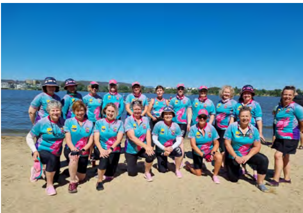
DA Canberra, DB ACT regatta 5 11 February 2023