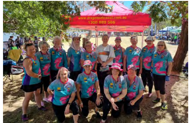
DA Canberra team, DB ACT Championships 18 March 2023

ACT Championships (held over two days, 18 and 19 March) is the culminating event on the DB ACT regatta calendar. We fielded crews on both days, with particular accolades going to those hardy women who raced 500m in 10s boats, jumped off, remarshalled, and immediately jumped back on the 20s boat to do it again. Very impressive.