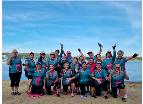
DA Canberra team, DB ACT Championships 500m 10s and 20s 19 March 2023