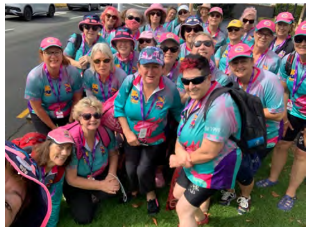
DA Canberra, Lake Karapiro 15 April 2023