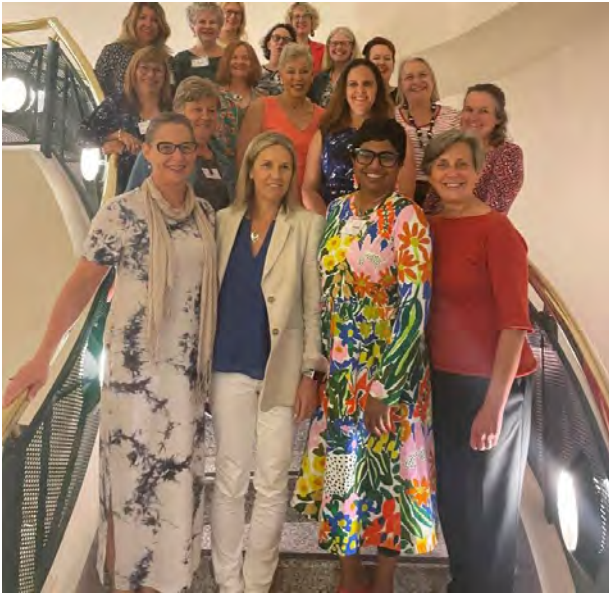
BCNA Think Tank consumer representatives 28 February 2023