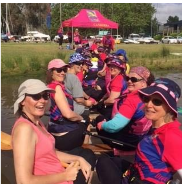
Dragons Abreast Canberra Come and Try session held 3 December 2016