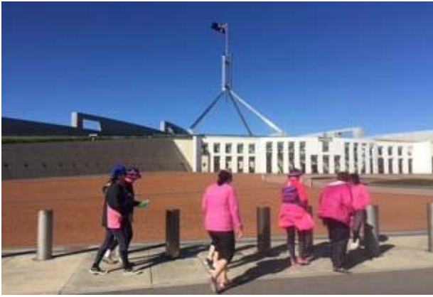
Dragons Abreast Canberra walk around Parliament House 7 November 2016