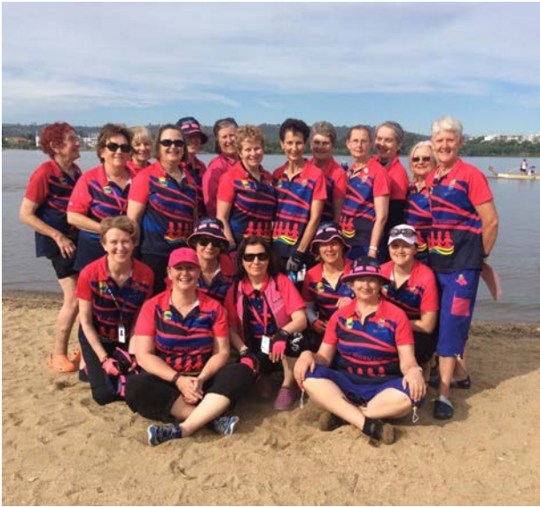
Dragons Abreast Canberra, DB ACT Regatta 21 January 2017