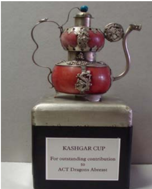
Kashgar Cup