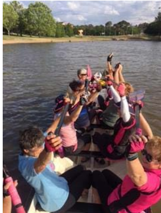
Dragons Abreast Canberra, Beijing Garden, Lotus Bay 1 December 2016

https://www.dragonsabreast.com.au/events/events/event/24-daa-convention