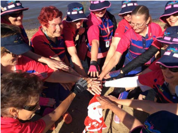
GoAnna! Dragons Abreast Canberra, DB ACT Regatta 10 December 2016

PO Box 7191, Yarralumla ACT 2600 • DRAGONSABREAST.COM.AU • ISSUE 62 • FEBRUARY 2017