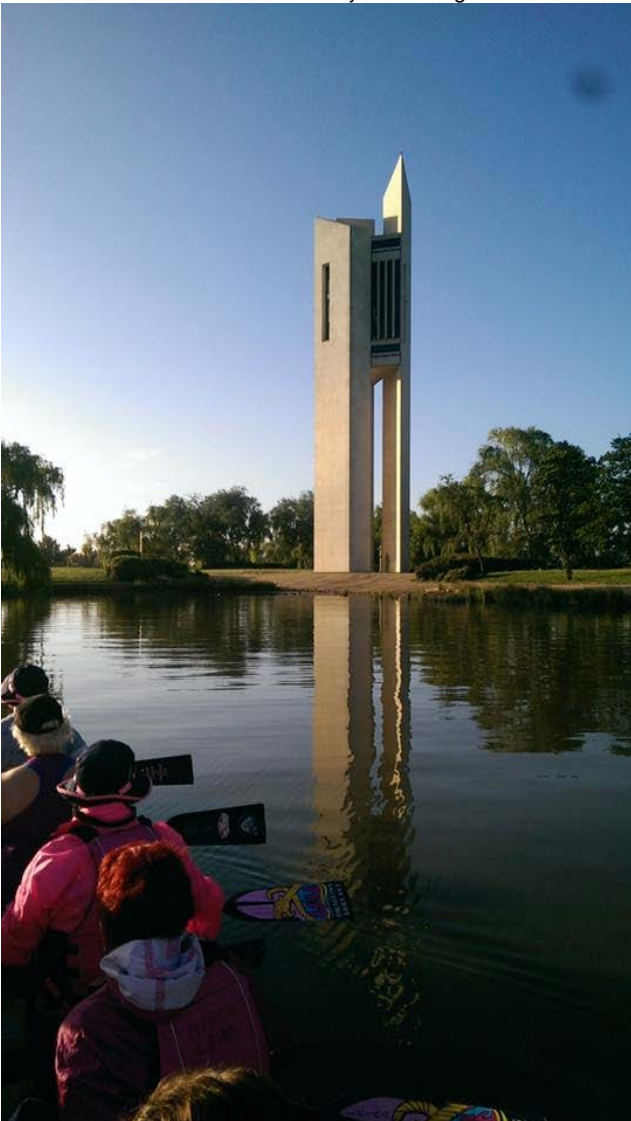
A calm moment for Dragons Abreast Canberra, National Carillon, 29 November 2016