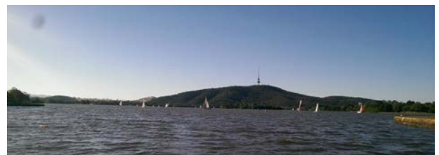
Lake Burley Griffin 7 December