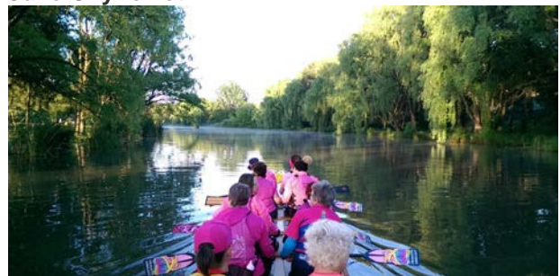
Sullivans Creek, ANU, Dragons Abreast Canberra 15 November 2016