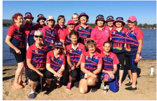
Dragons Abreast Canberra, DB ACT Regatta 19 November 2016

Doodle link: http://doodle.com/poll/gq7yaw2fweab3mhd http://www.florencebcs2018.org/