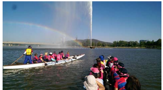
Dragons Abreast Canberra, Chinese New Year, Captain Cook Memorial Jet, Lake Burley Griffin 28 January 2017