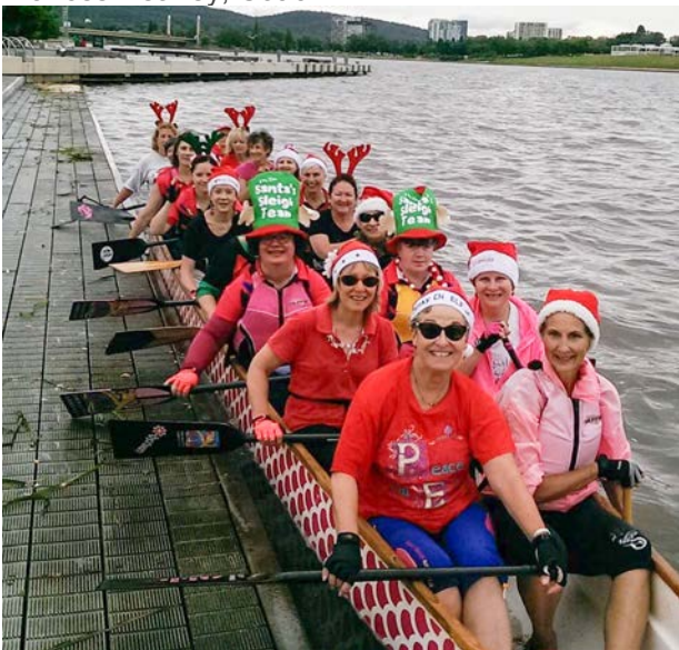
Dragons Abreast Canberra, Christmas Carol paddle 14 December 2016