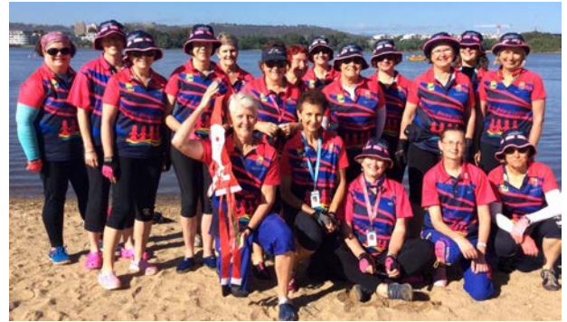
Dragons Abreast Canberra, DB ACT Regatta 10 December 2016