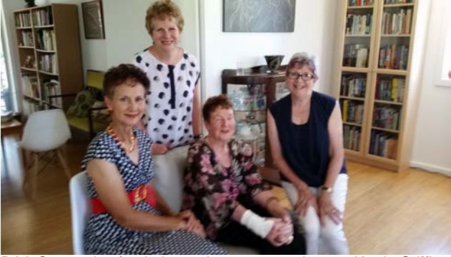
DAA Convention fundraiser 7 January 2017