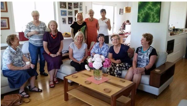
DAA fundraising morning tea 7 January 2017