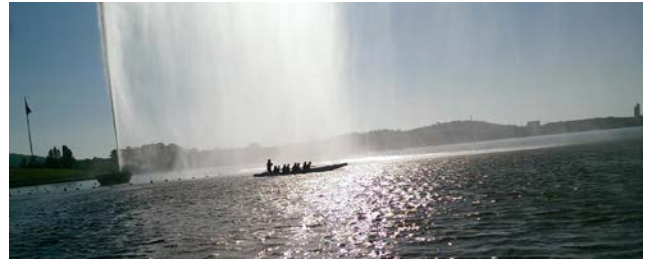
Dragons Abreast Canberra, Chinese New Year, Gecko is sprayed Captain Cook Memorial Jet, Lake Burley Griffin 28 January 2017