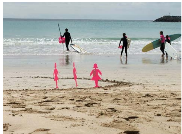
BCNA pink lady silhouettes

http://www.fernwoodfitness.com.au/weight-loss---exercise/well-being/fernwood-partners-with-bcna-to-support-women-diagn/