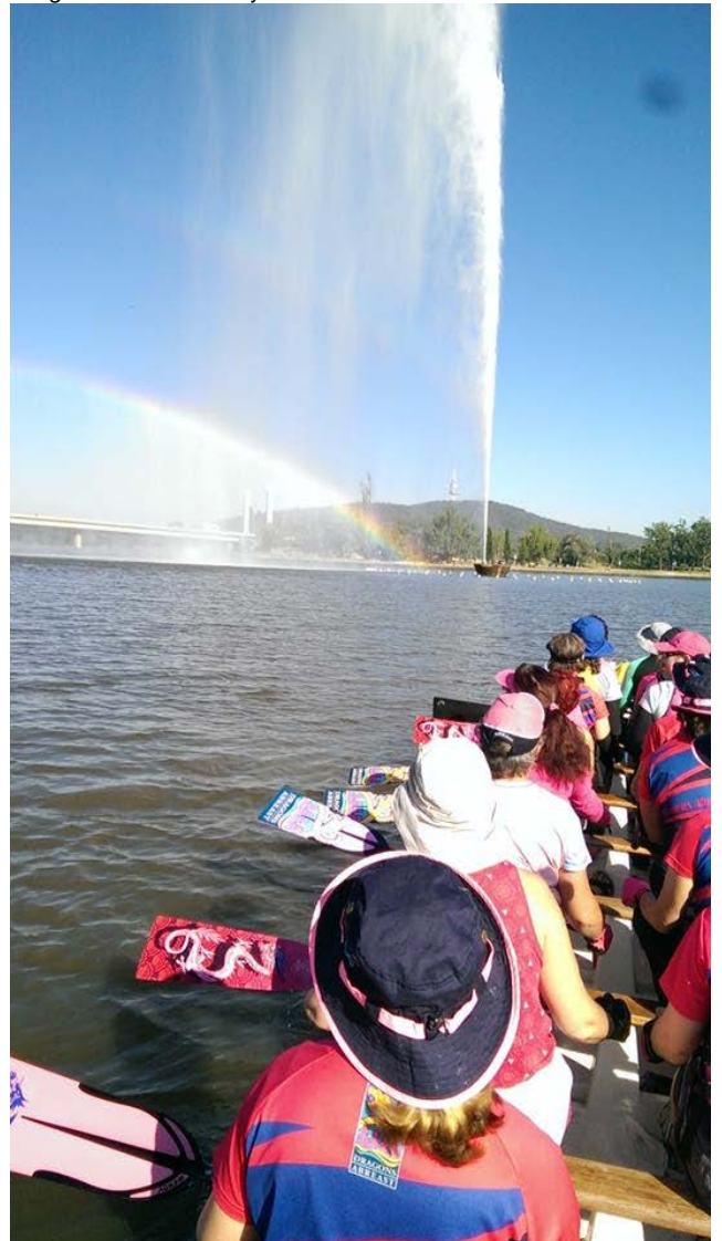
Exciting rainbows, Dragons Abreast Canberra, Chinese New Year, Captain Cook Memorial Jet, Lake Burley Griffin 28 January 2017