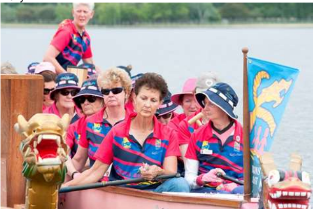
Flowers on the water ceremony, DA Corporate and Social Regatta, 17 October 2015