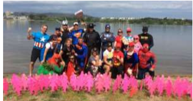
US Embassy: Breast Friendz shared first place for best dressed team. They looked sensational on and off the water. DA Corporate and Social Regatta 17 October 2015