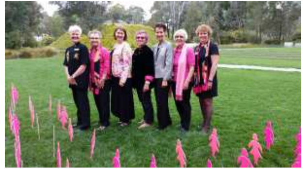
BCNA Mini Field of Women, in front of James Turrell's Within without skyspace, National Gallery of Australia, 13 October 2015

Socials / At Bosom Buddies 20th anniversary dinner, Woden - Canberra CityNews