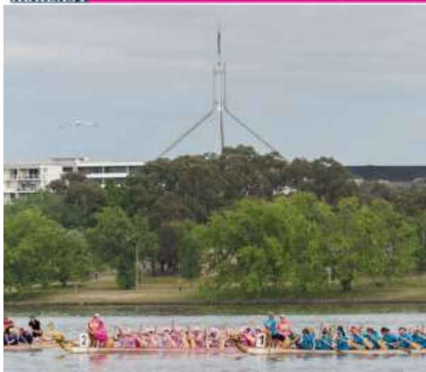
DA Corporate and Social Regatta 17 October 2015

PO Box 7191, Yarralumla ACT 2600 • DRAGONSABREAST.COM.AU • ISSUE 58 • NOVEMBER 2015