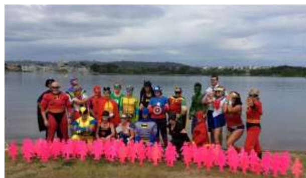
Pioneer Training- Pioneer Super Heroes shared first place for best dressed team and won the C Final. Fantastic effort your team looked sensational both on and off the water. DA Corporate and Social Regatta 17 October 2015

Next year's DA Social and Corporate Regatta will be held on Saturday 8 October with the theme — Disney characters . The next national Dragons Abreast Australia (DAA) Festival will be 29 October 2016 at Darling Harbour, Sydney.