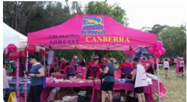
Cake stall, DA Corporate and Social Regatta 17 October 2015