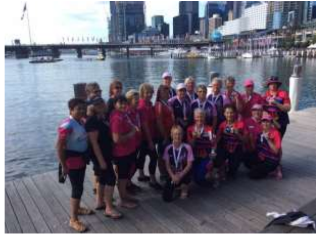
Team Inspiration international team won gold at the DAA Festival Darling Harbour 24 October 2015

The DAA Festival is an annual event and the major fundraiser for Dragons Abreast Australia, a national