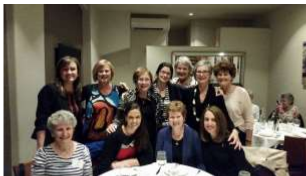
BCNA science and advocacy course delegates, 22 October 2015