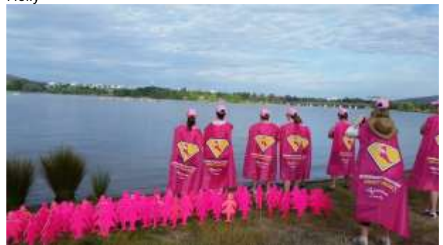
Women in Super, DA Corporate and Social Regatta, 17 October 2015