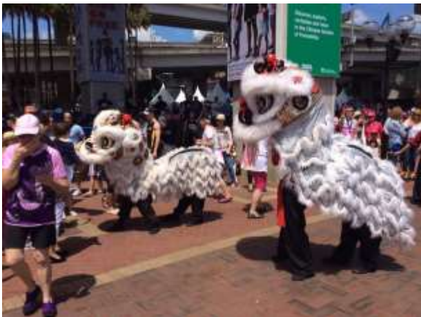
DAA Festival Darling Harbour 24 October 2015