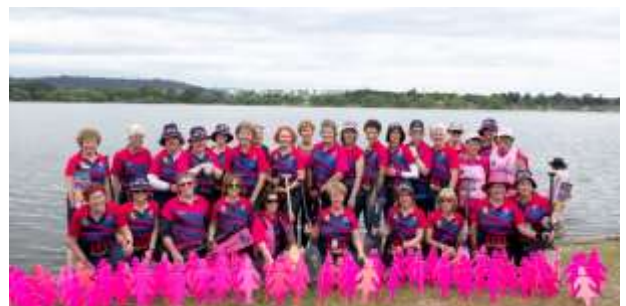
DA Corporate and Social Regatta, 17 October 2015