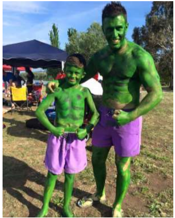
The Hulks, Canberra Regatta 17 October 2015