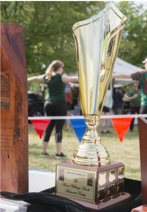
DA Corporate and Social Regatta, 17 October 2015