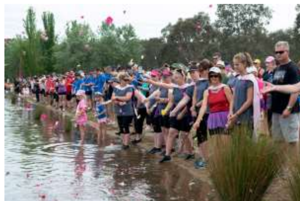
Crowds at Grevillea Park during the DAA Flowers on the water ceremony, DA Corporate and Social Regatta 17 October 2015