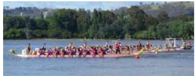
DB ACT regatta, 7 November 2015 regatta