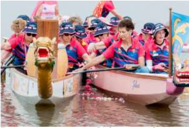
Flowers on the water ceremony, DA Corporate and Social Regatta 17 October 2015

Dragons Abreast Canberra is donating money to the following organisations for local and national groups supporting women on their breast cancer journey.