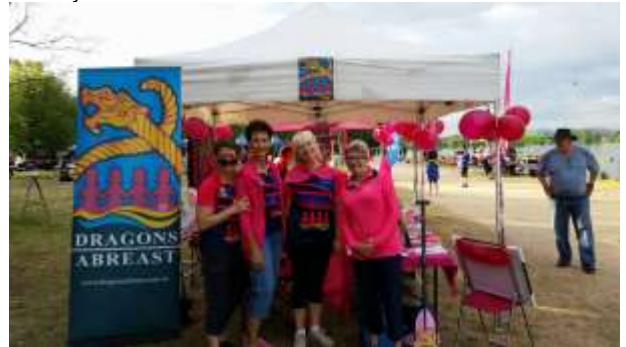
DA Corporate and Social Regatta, 17 October 2015