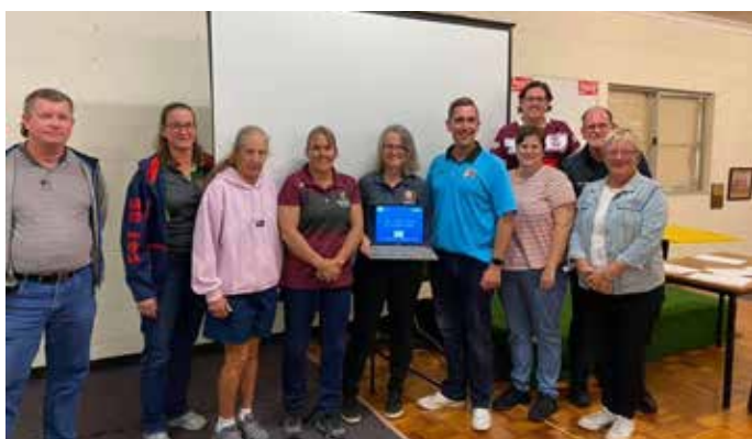
Level 1 Tech Course at U18 State Championships