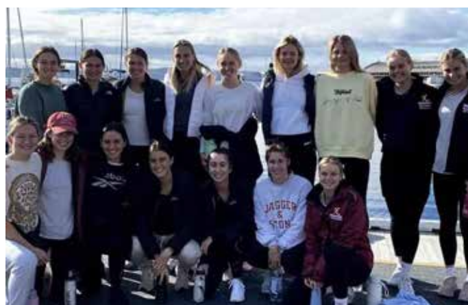
High Performance Tassie Tour - October 2021