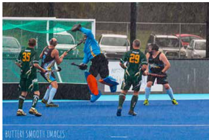
State Championships 2021