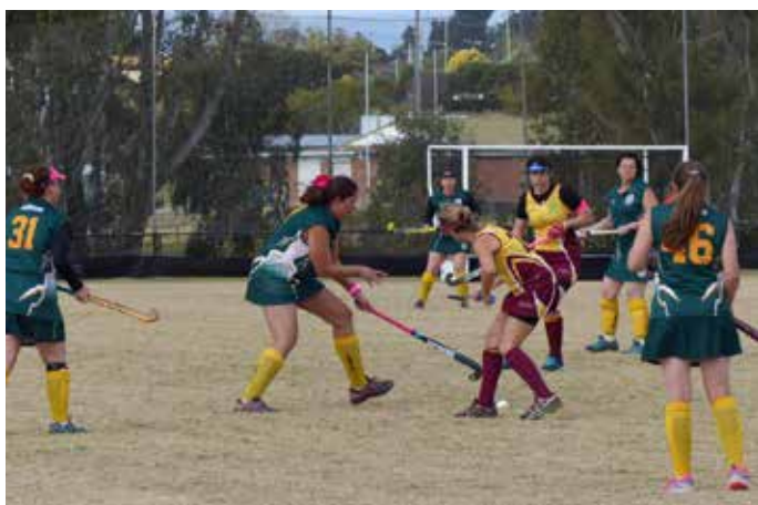
Women's Masters State Championships, Warwick