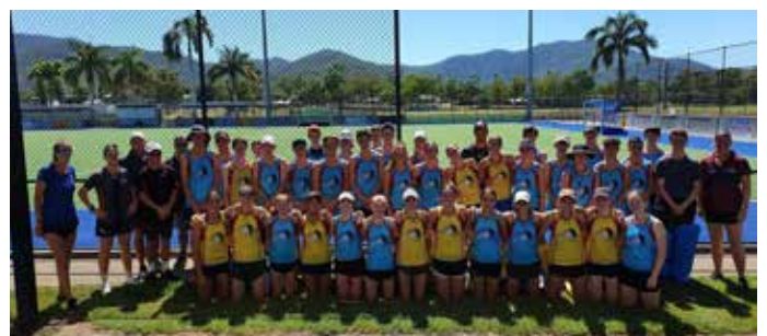
16 Years Camp North