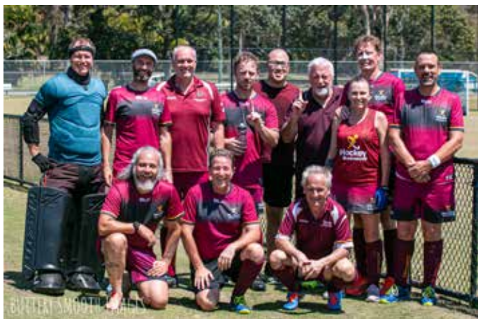
Social Masters Carnival - Gold Coast

This year QMMHC again hosted an end of season social carnival at the Gold Coast in October 2021. With the Nationals being cancelled people were again keen for a carnival like event to take place. Over 135 players aged 34 to 75+ took on the heat and humidity of the Gold Coast for the 2-day carnival. People were allocated to teams in age groups to even out the teams. Again, there were no official winners, but a great time was had by all that attended.