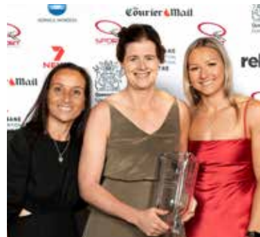
The rebel 2021 Queensland Junior Sport Team of the Year