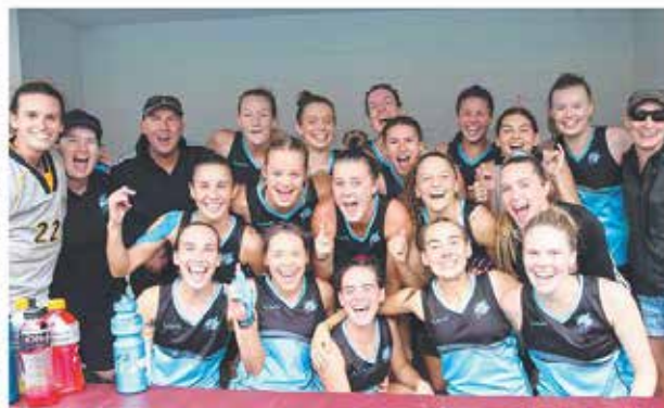
The South Coast Sharks' women celebrate their Queensland Super League triumph.

"The girls were so happy and even more so because we'd played Brisbane in the final twice already," said the