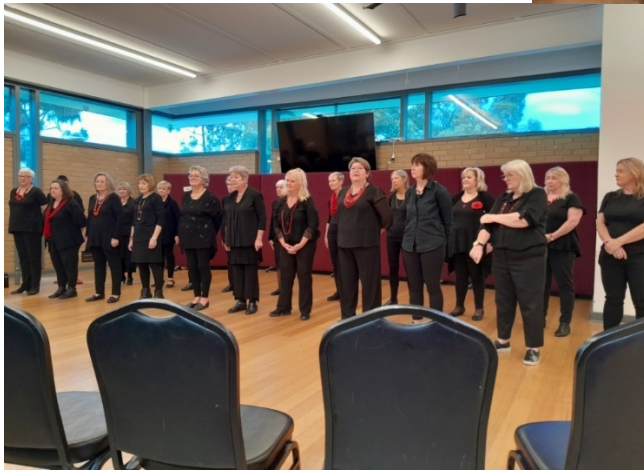
Fun at the November meeting. Who is the clown ?