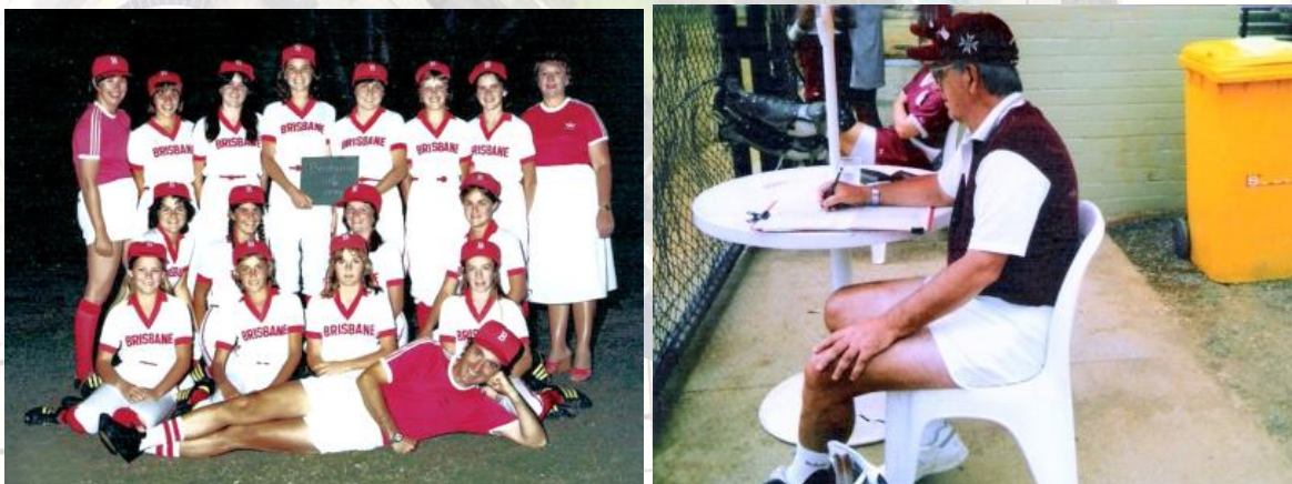
Brisbane and Jaguars A Grade as well as Bears and Panthers A Grades.