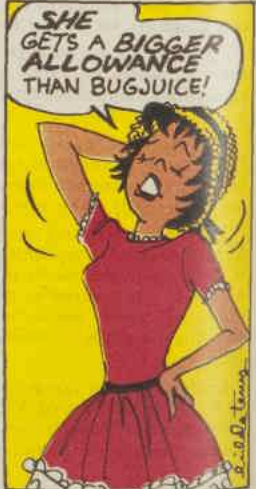
Supplement to The Australian Women's Weekly - October 9, 1963