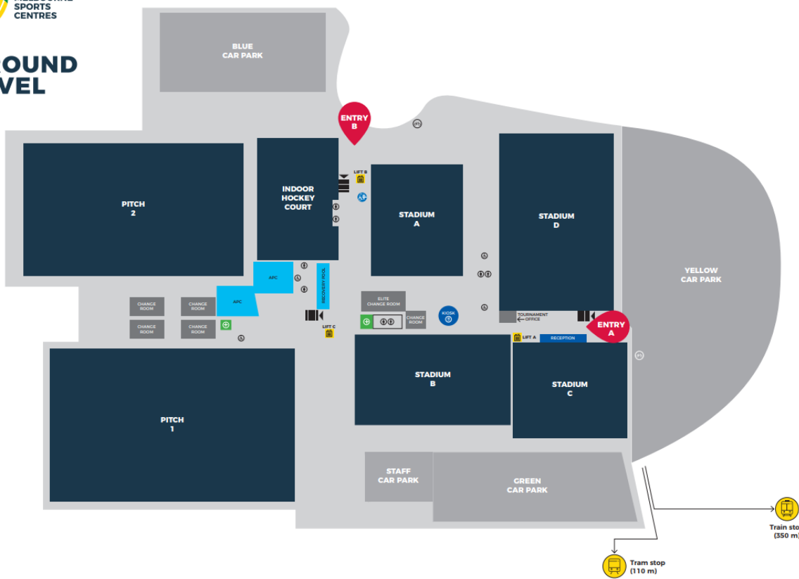
Figure 1: Map of MSC Parkville (Ground Level)