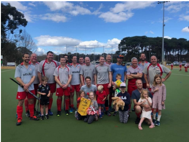
O40 Division 1 Men – 6th Premiership in a Row