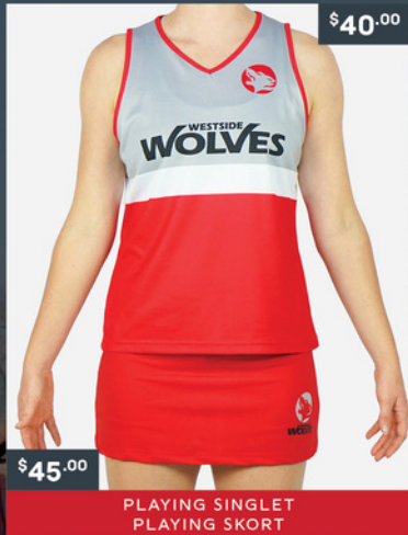
PLAYING SINGLET PLAYING SKORT