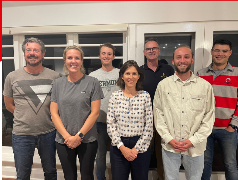
Welcome the new Board of Westside Wolves Hockey Club