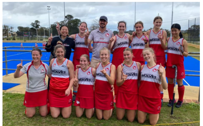
Women's Division 4 (WW3) – Top of the ladder, will be promoted to Div 3 in 2022 & GF Runner Up