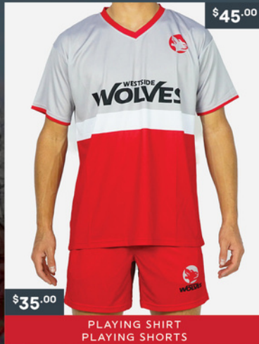
PLAYING SHIRT PLAYING SHORTS