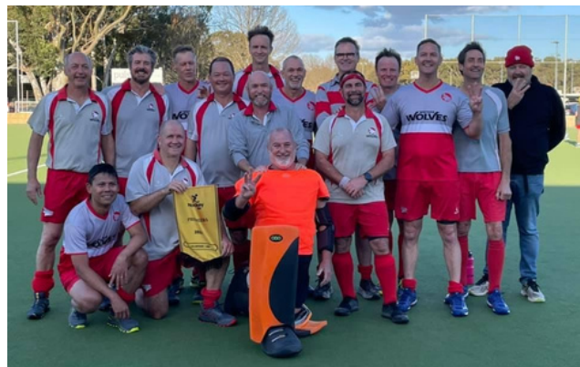
O50 Division 1 Men – GF Winners