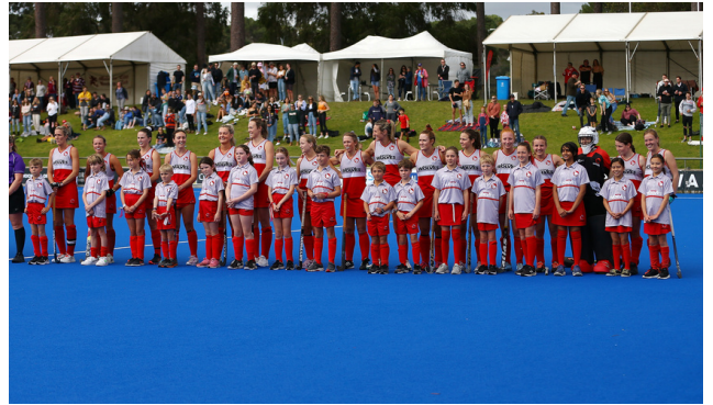
Women 1 & 2 Both GF Runner Up