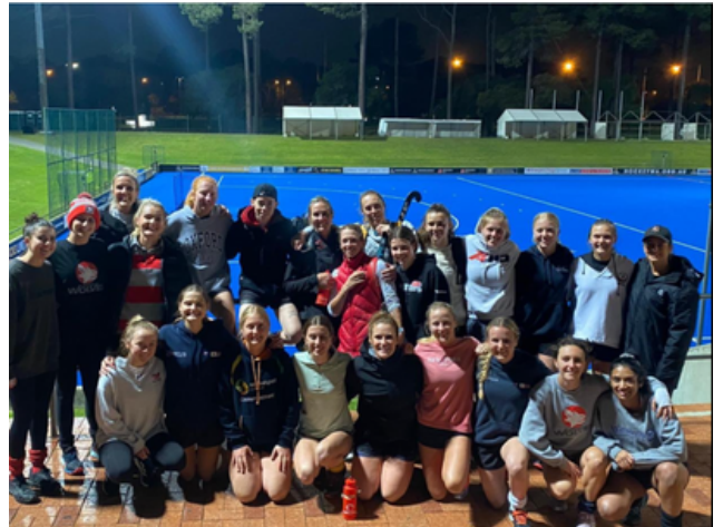
Women 1 & 2 Both GF Runner Up