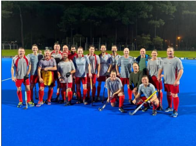
MidWeek Masters – GF Winners