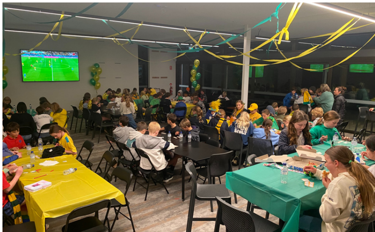
5/6 Bingo and Matilda's Semi-Final night