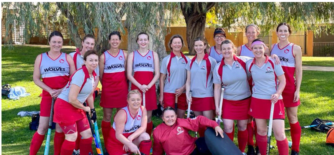
Metro 1 Ladies - Finals bound

The latest news and updates from the Wolf Pack