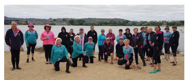
DA Canberra DB ACT Regatta 4 12 December 2020