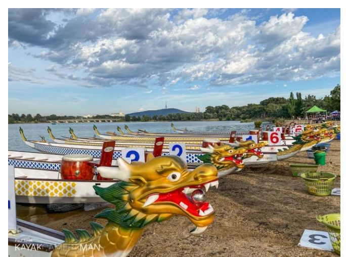
Regatta 3 28 November 2020 dragon heads