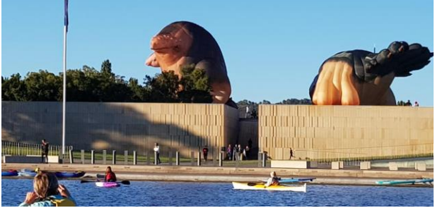
Skywhalepapa and Skywhale DA paddle Sunday 7 February 2021