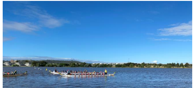
DA Canberra in 2 km race, DB ACT Regatta 4 12 December 2020