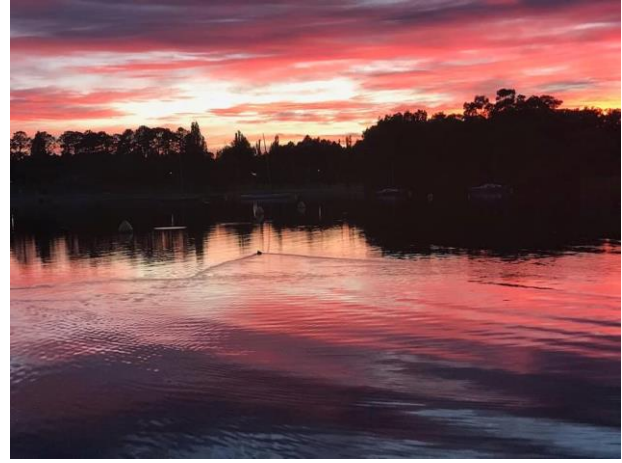
Sunrise, 12 January 2021